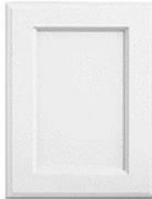
CABINETS Extra White