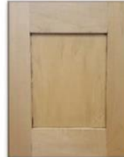
CABINETS Natural Matte Full Ebony