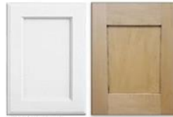
CABINETS Extra White • Perimeter Natural Matte • Island