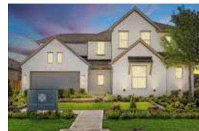
Hamilton Thomas Homes