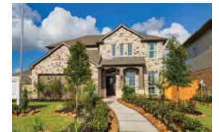
Devon Street Homes