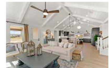
K. Hovnanian Homes