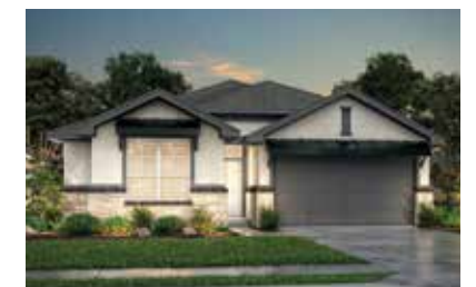
Willow at Marvida Homes for Rent