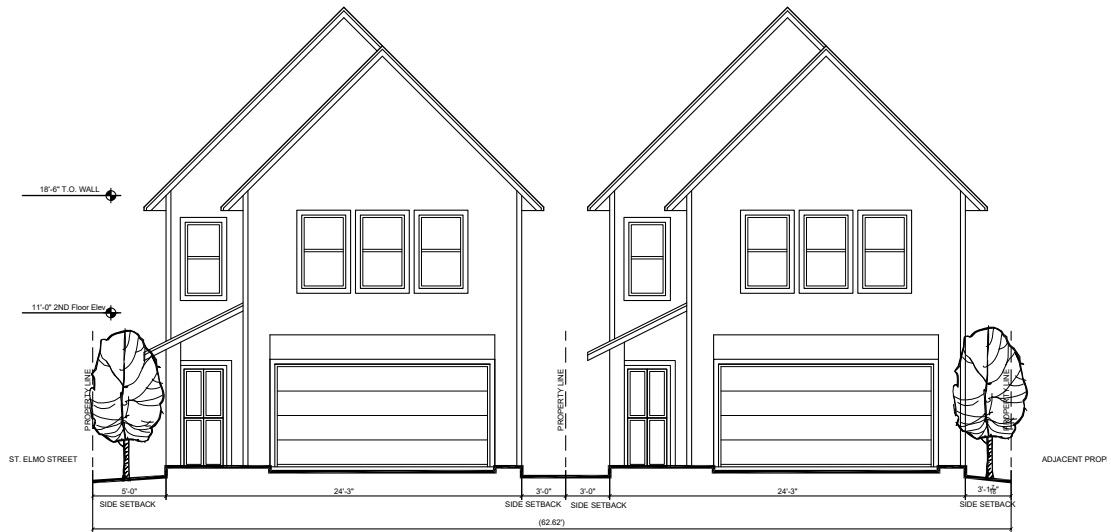
OATS STREET ELEVATION SCALE: 1/8" = 1'-0"