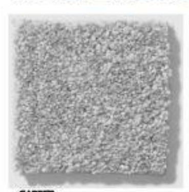
ALBERT PLACE FOG