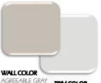
AGREEABLE GRAY SW7029