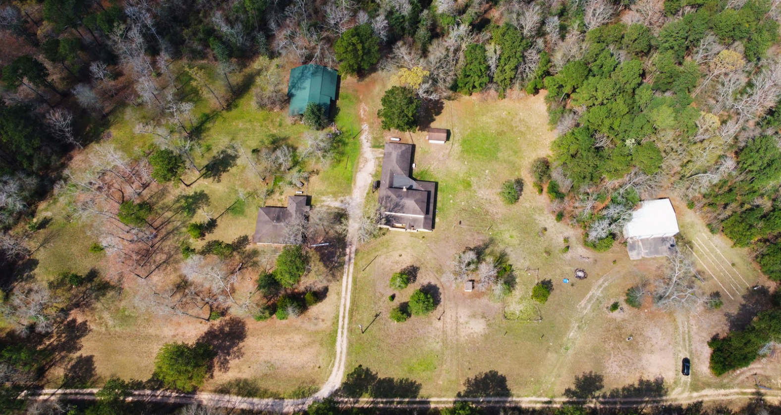
All information is deemed reliable, but is not warranted by MOCK RANCHES GROUP. All information is subject to change without prior notice.