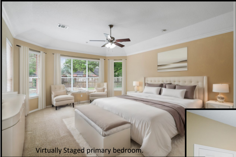
Virtually Staged primary bedroom.