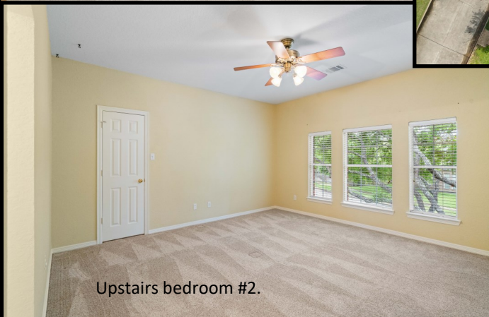
Upstairs bedroom #2.