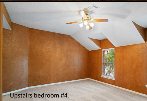
Upstairs bedroom #4.