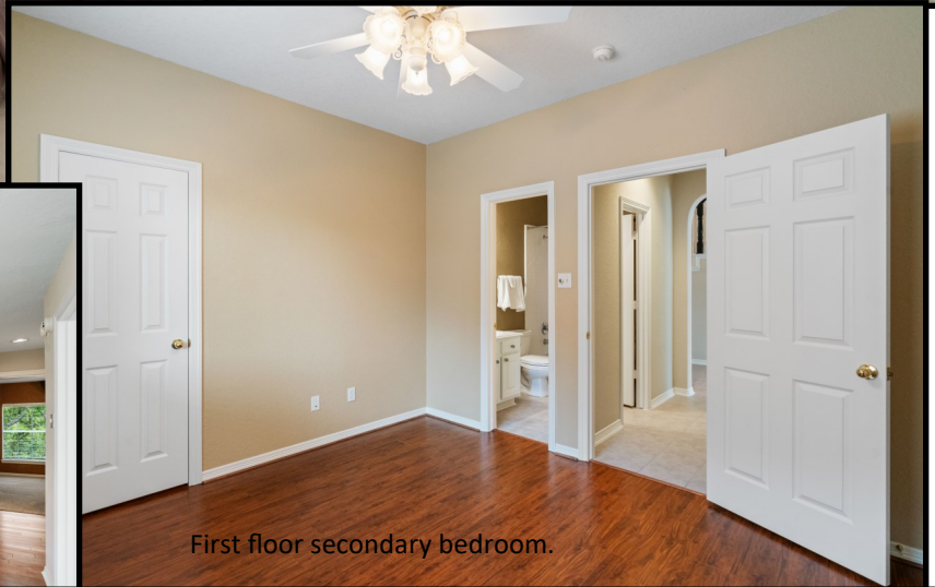
First floor secondary bedroom.