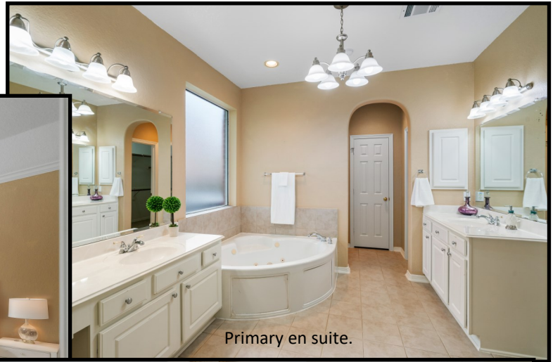
Primary en suite.