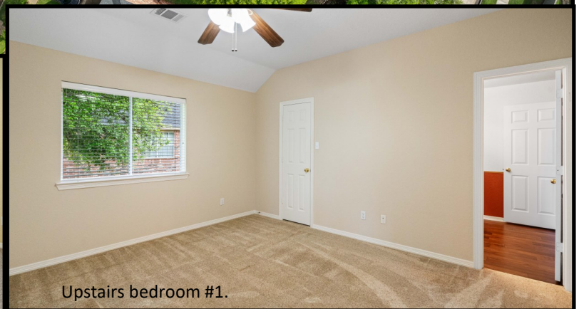
Upstairs bedroom #1.