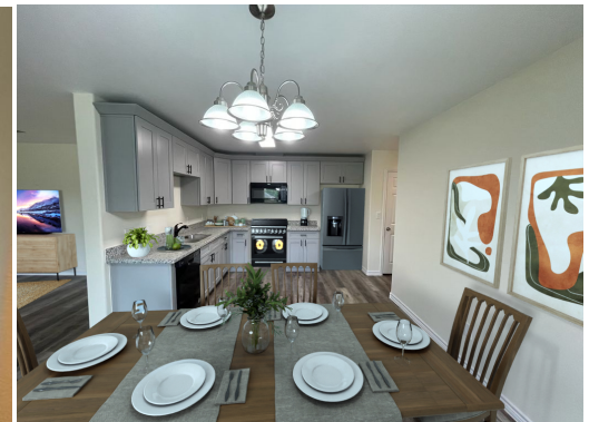
Rendering for illustrative purposes only.