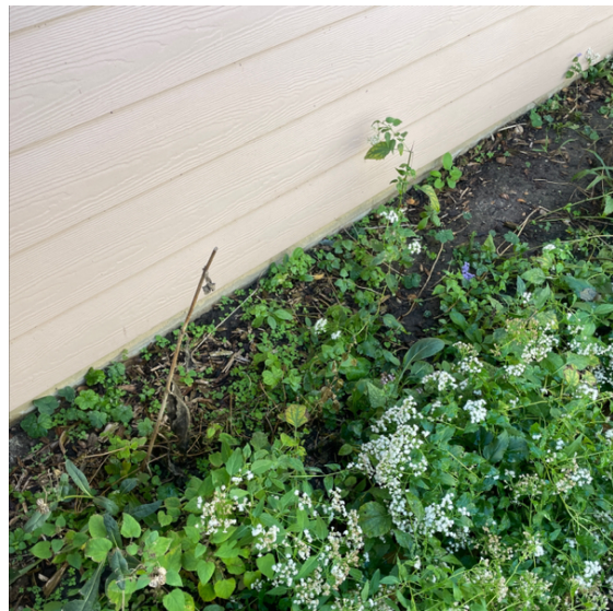
Other Treatment Photos