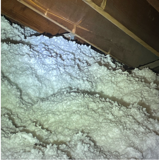
INTERIOR AREAS - ATTIC