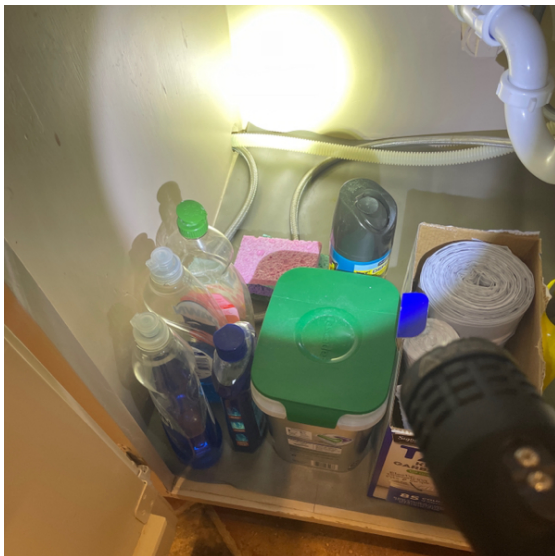
Other Treatment Photos