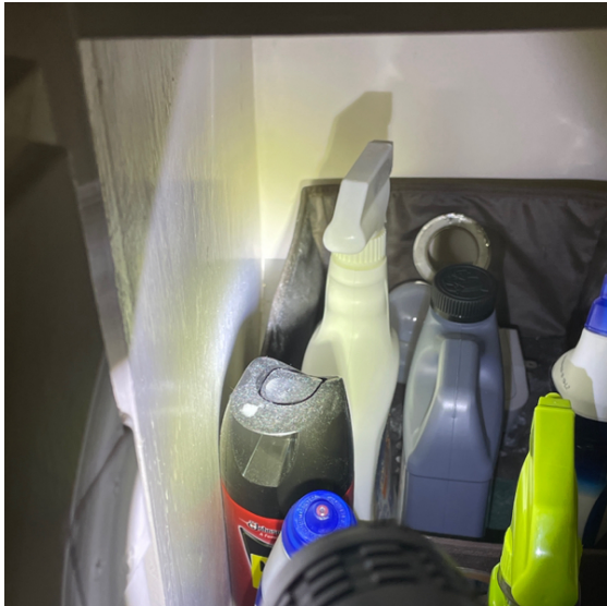
Other Treatment Photos