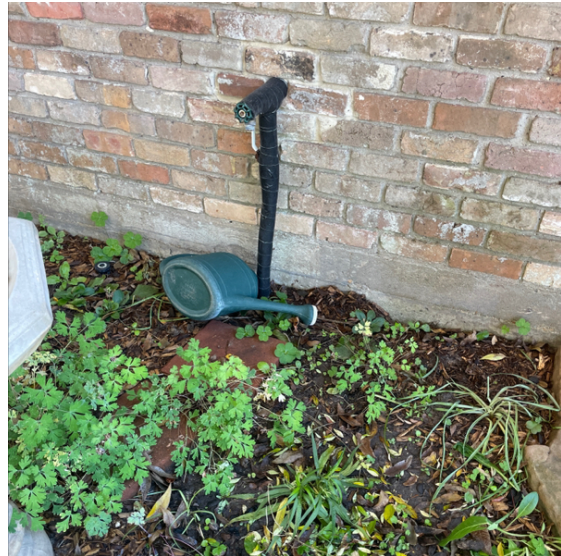
Other Treatment Photos