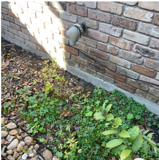
Other Treatment Photos