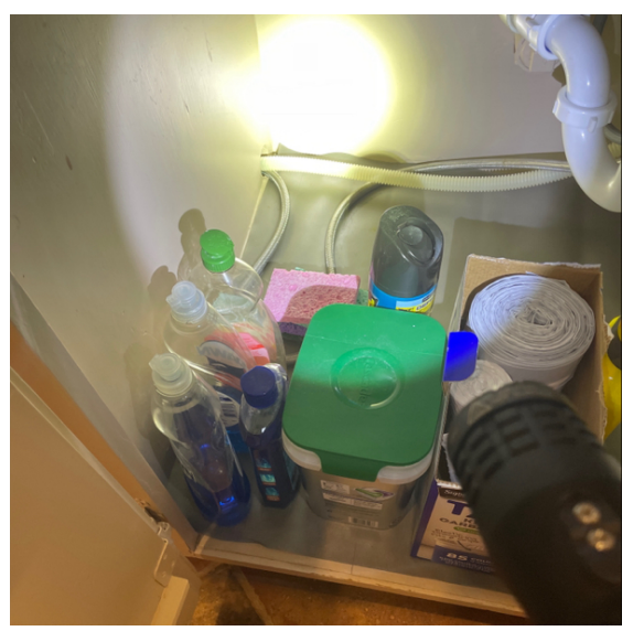
Other Treatment Photos