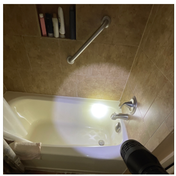
Other Treatment Photos