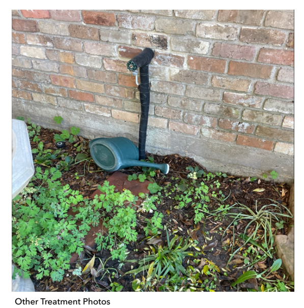
Frontyard foundation termite free