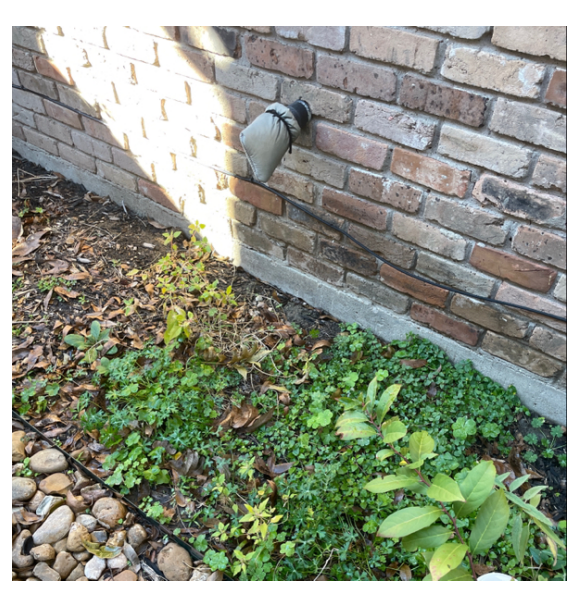
Other Treatment Photos Both left and right side of house termite free