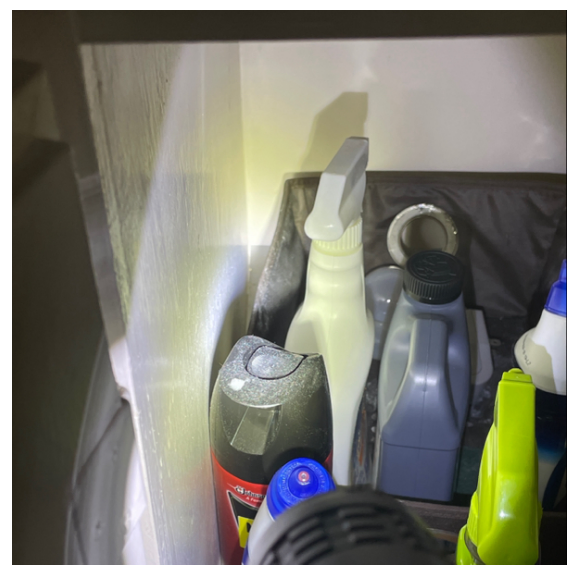
Other Treatment Photos