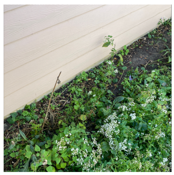
Other Treatment Photos