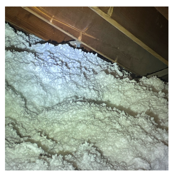
INTERIOR AREAS - ATTIC