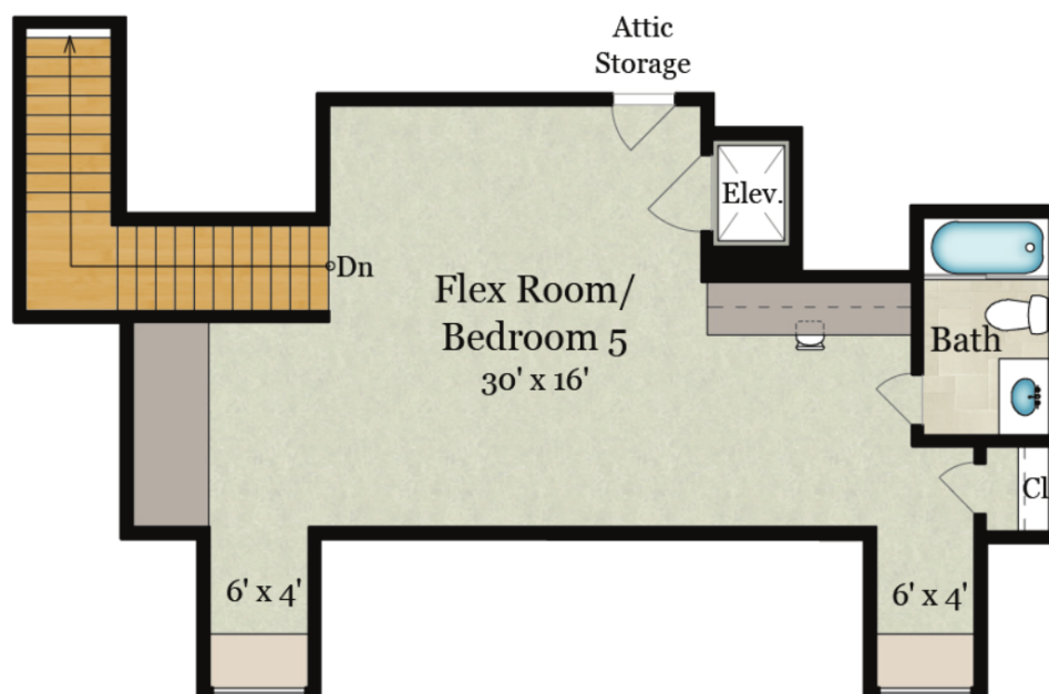
MAIN RESIDENCE UPPER LEVEL 2