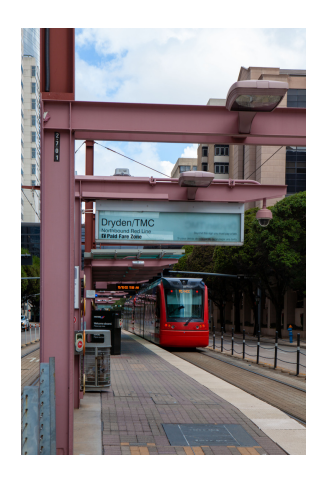
Lightrail Station to Midtown/ Downtown (0.9mi)

New TMC3 Helix Gardens (0.1mi) and TMC (0.5 mi)