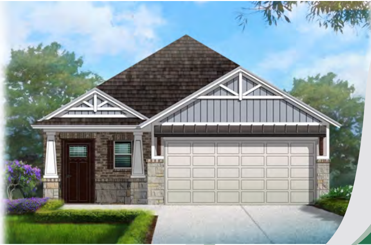
*ELEVATION PER SUBDIVISION REQUIREMENTS