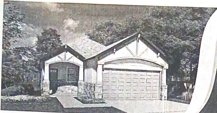
*ELEVATION PER SUBDIVISION REQUIREMENTS