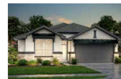
Willow at Marvida Homes for Rent