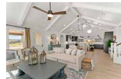
K. Hovnanian Homes