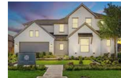
Hamilton Thomas Homes