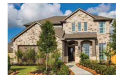
Smith Douglas Homes