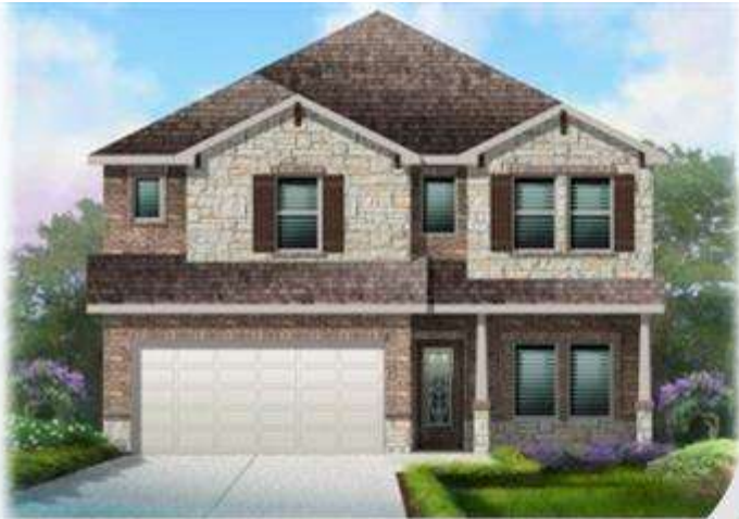
*ELEVATION PER SUBDIVISION REQUIREMENTS*