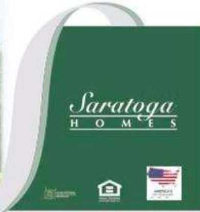
Build responsibly. Choose wood from well-managed forests.