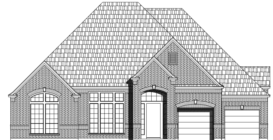
PLAN 4004W E-2