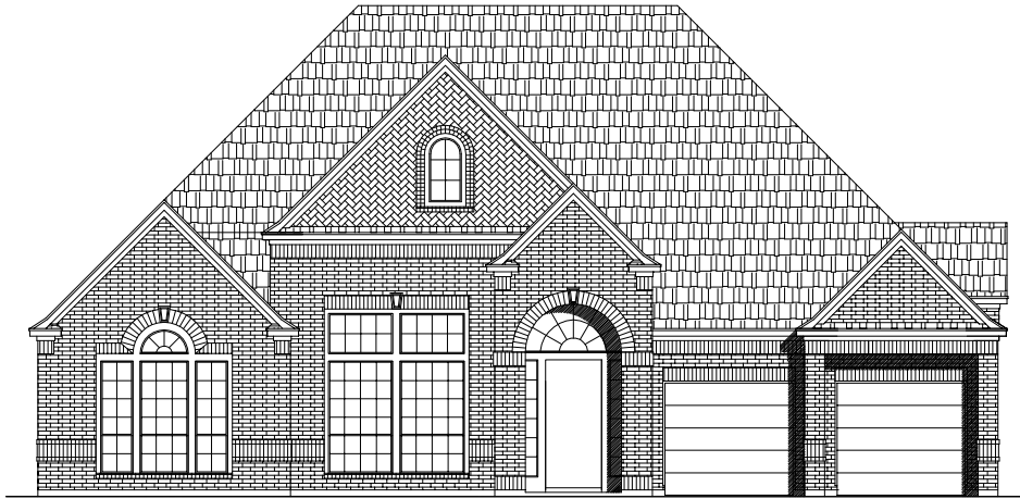
PLAN 4004W E-1

Some of the elevations shown may not be available in all communities.