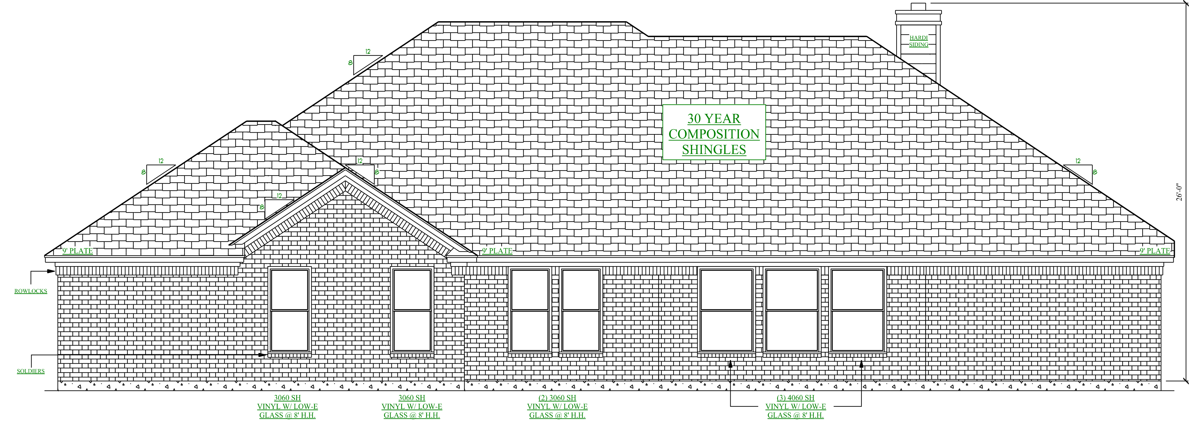
REAR ELEVATION SCALE: 1/4" = 1'-0"