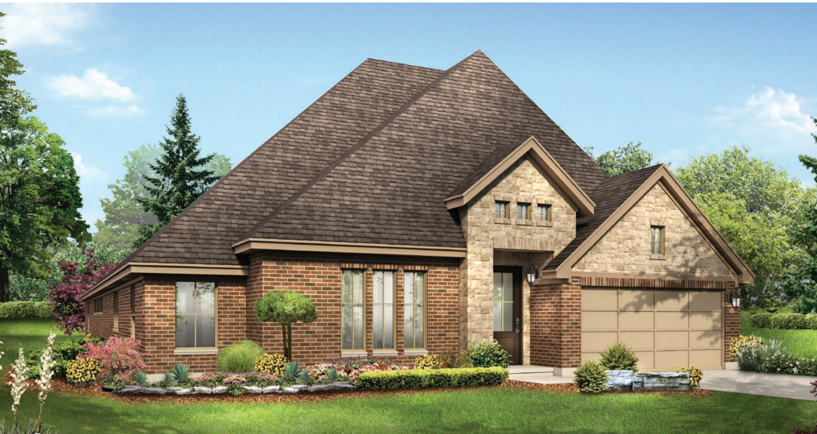
STYLE C WITH OPTIONAL STONE - 2438 SQ.FT.