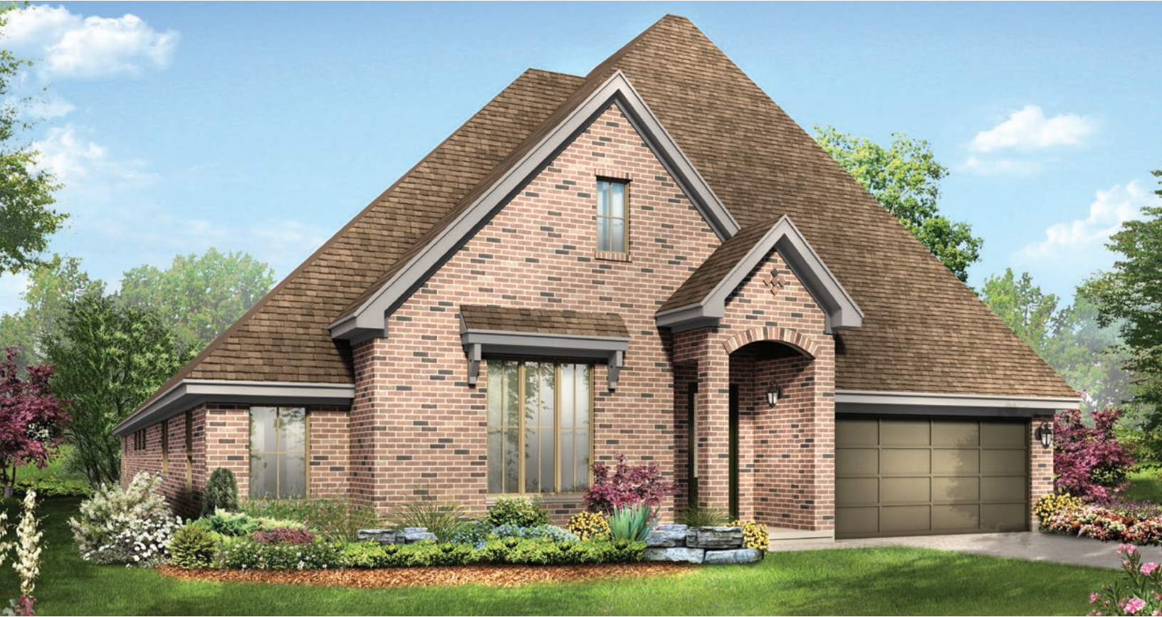
STYLE B - 2438 SQ.FT.