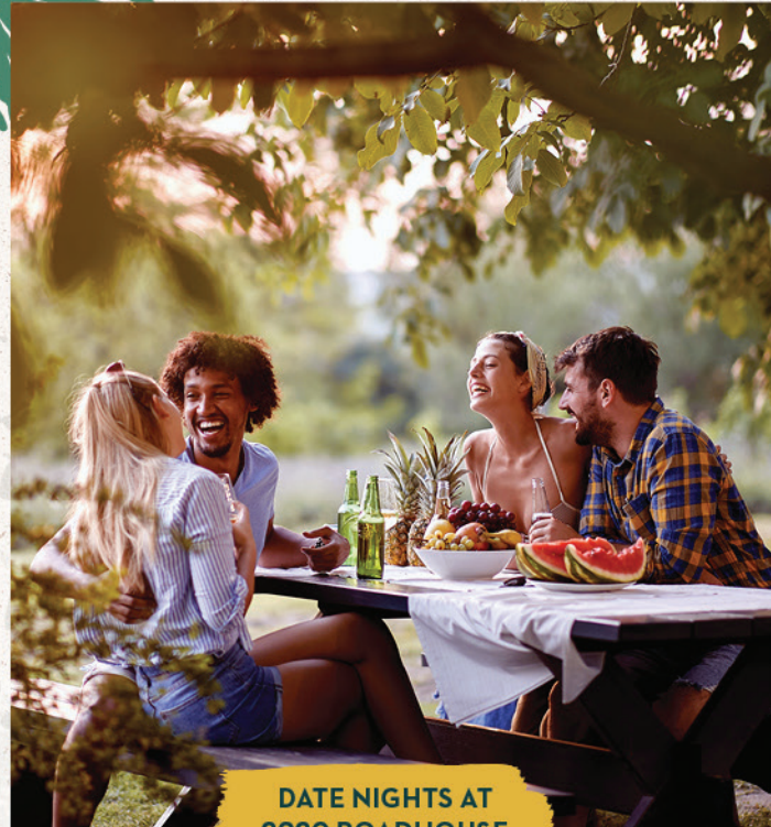
DATE NIGHTS AT 2920 ROADHOUSE