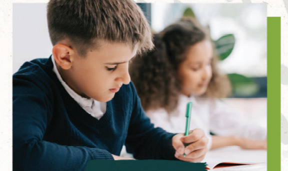
PRE K - 12