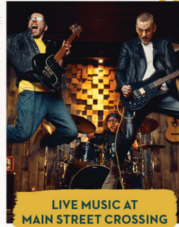
LIVE MUSIC AT MAIN STREET CROSSING