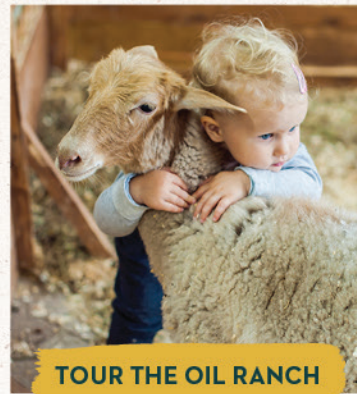
TOUR THE OIL RANCH