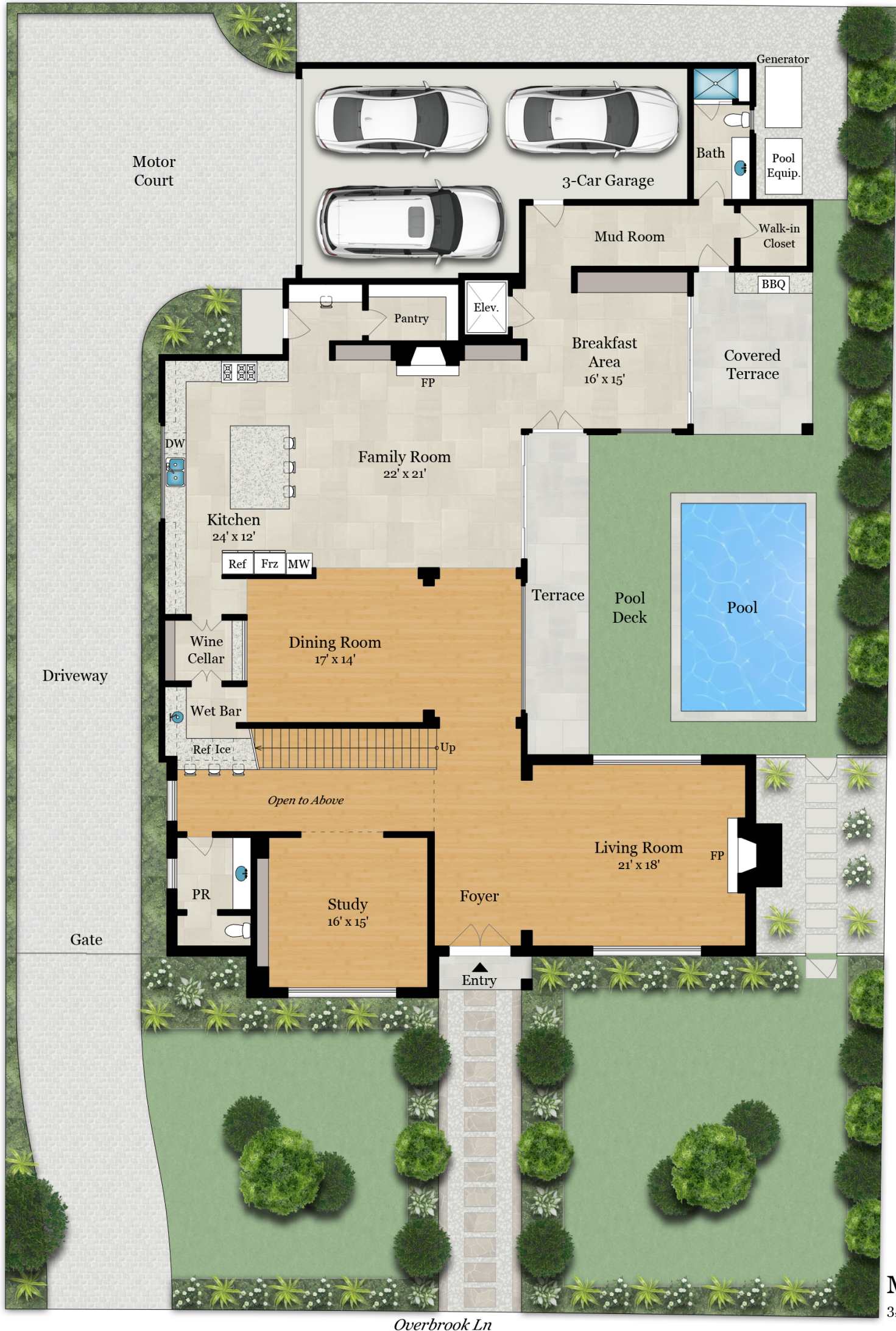
MAIN LEVEL 3,224 SQ FT