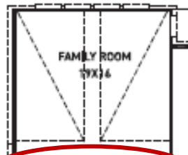
OPT. POINTED VAULT OPT. ARCHED VAULT