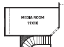
OPT. EXTENDED MEDIA ROOM +64 SQ.