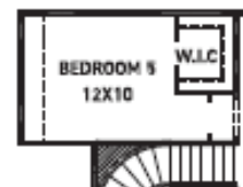
OPT. BEDROOM 5 @ MEDIA ROOM +64 SQ.