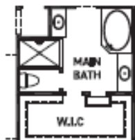
OPT. ENLARGED MAIN SHOWER W/ TUB