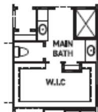
OPT. MAIN BATH LAYOUT W/ ENLARGED SHOWER