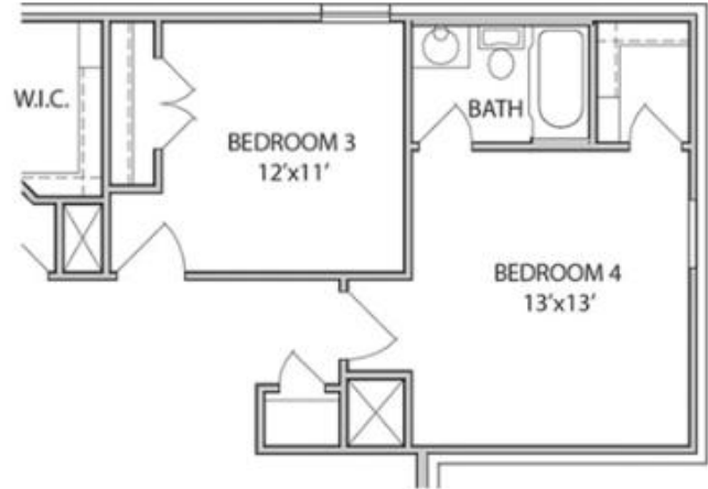
Second Floor opt Bath