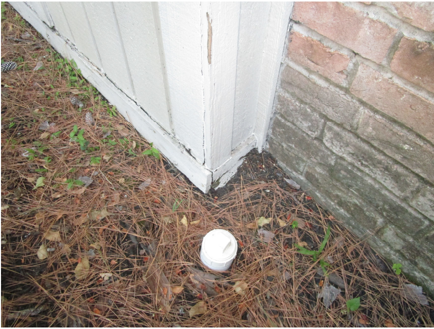
Soil line too high / Wood rot / Wood to earth contact