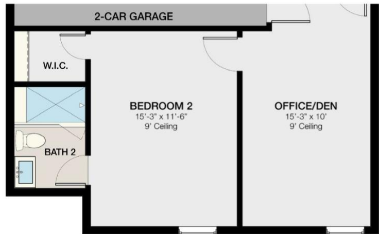
UPGRADE OPTION A OFFICE/DEN 2,279 Square Feet (Living)