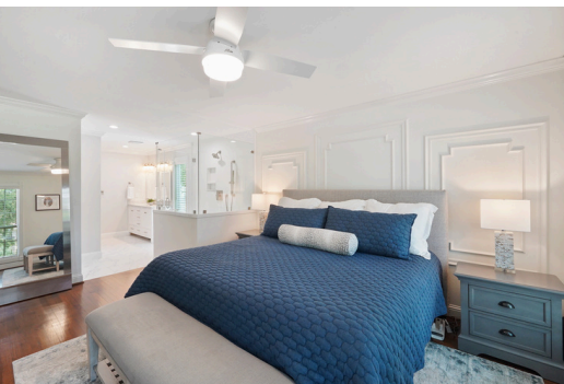
Be sure to check out our 3D tour.