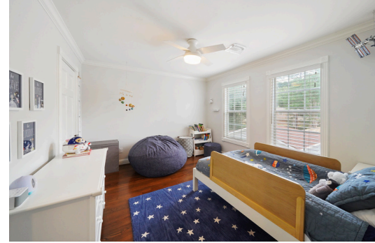
Continuing down the hall, you will come to the first of your two secondary bedrooms on the left. This room boasts crown molding, custom blinds, hardwood floors and a large closet.