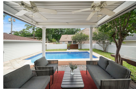
Now to your backyard oasis! Enjoy your day outside under your covered veranda!