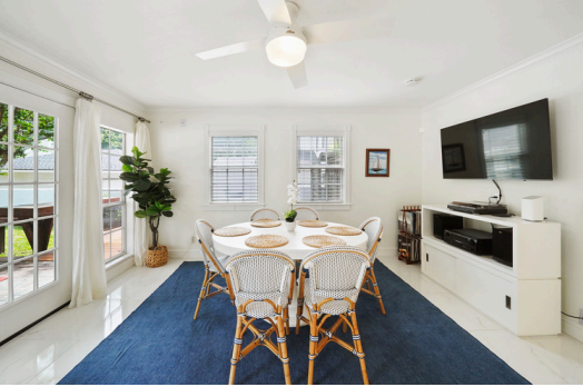
Perfectly situated breakfast room located at this end of the kitchen with access to your backyard oasis. We will take a look outside in a bit!