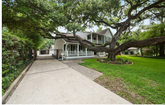
Nestled on a 12,600- sqft lot in the heart of Garden Oaks with extra parking in the front as well as an automatic driveway gate.