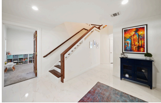
Now let's take a look at the second floor!