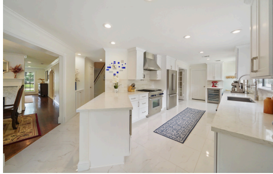
Not pictured but down the hallway on the left is your conveniently located half bath and to the right is your large laundry room with storage from the container store!