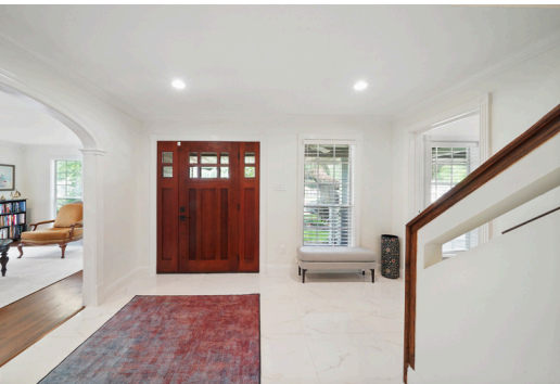
Be sure to check out our 3D tour!