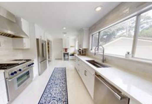
The doorway straight ahead is your large walk-in pantry with automatic lights and storage from the container store allowing for seamless party organization.