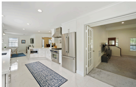
Now let's take a look at the bonus flex space!