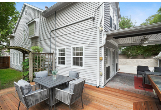
You also have a secondary wood deck that leads to your side yard through the beautiful archway.