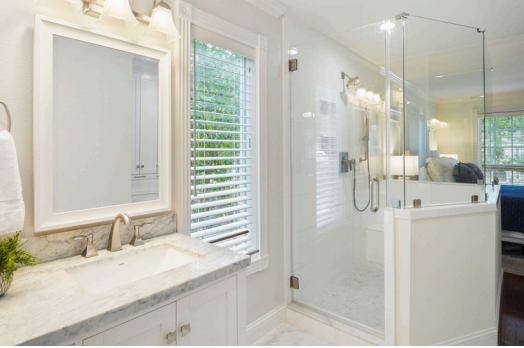
End your day with relaxation in this seamless shower with bench seating.