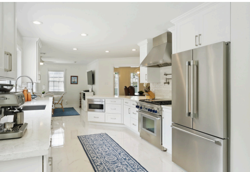
Your new kitchen is equipped with Thermador appliances which include a dual fuel range with pot filler, fridge, built-in microwave drawer, built-in beverage fridge, and dishwasher.