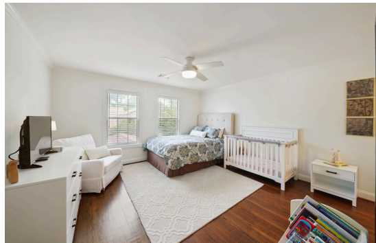
Here is your third bedroom on the second floor. This room also boasts crown molding, custom blinds, hardwood floors and a large closet.