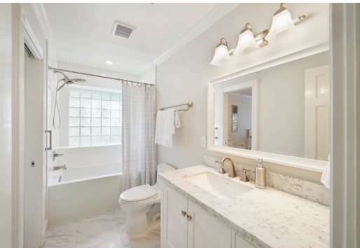
Conveniently located between the 2 secondary bedrooms is your second full bath with tub/shower combo. This bathroom has ensuite access from the 3rd bedroom and is also adorned with marble countertops.