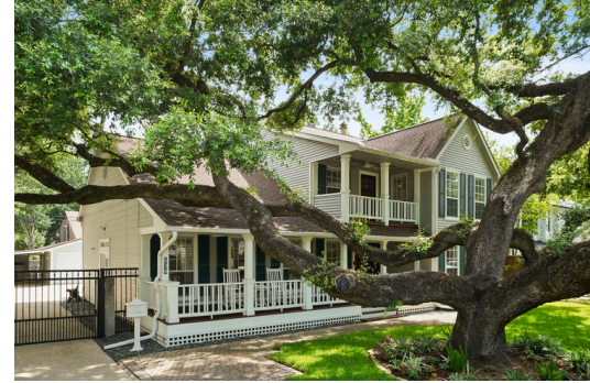
Stunning curb appeal with large front porch and second floor balcony, more on that in a bit!