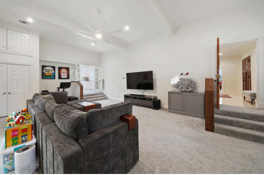
Schedule your showing today!