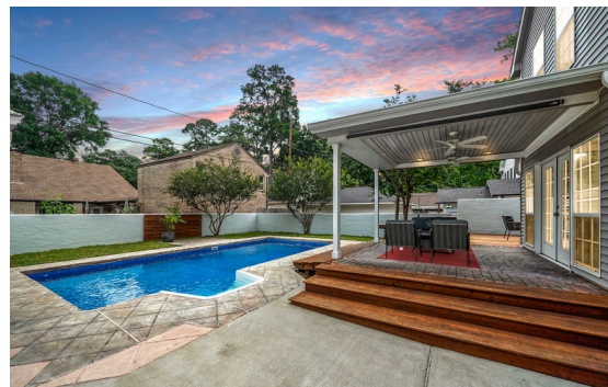
New liner and filter recently installed. This pool is also equipped with a Katch A Kid net and pool cover.