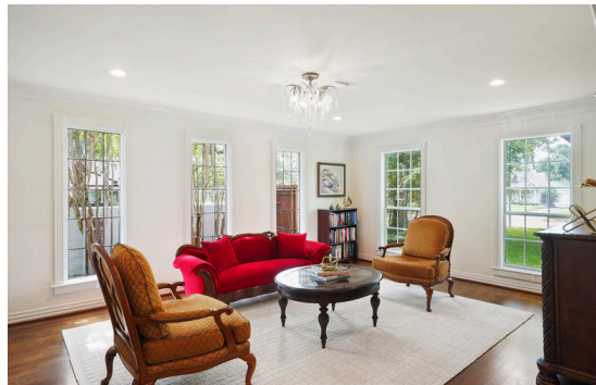
Upon entry, to the right, sits your formal living room. Large windows allow an abundance of natural light to fill the space.