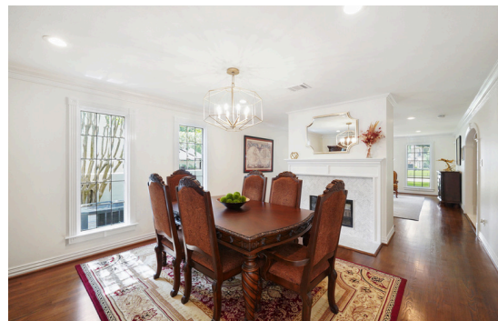
Light and bright continues into the formal dining room. Character really speaks throughout this home! You have to see it for yourself!