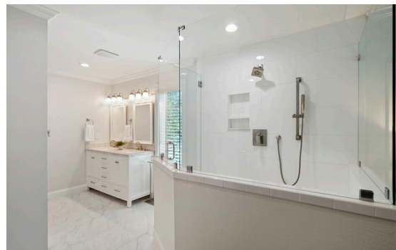
Walk right into your elegant primary bath with a spacious shower, dual sinks with marble counters, and tile flooring.