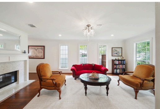
This room boasts solid wood floors, recessed lighting, a beautiful chandelier and gas, wood burning fireplace, crown molding and elegant wood trim.