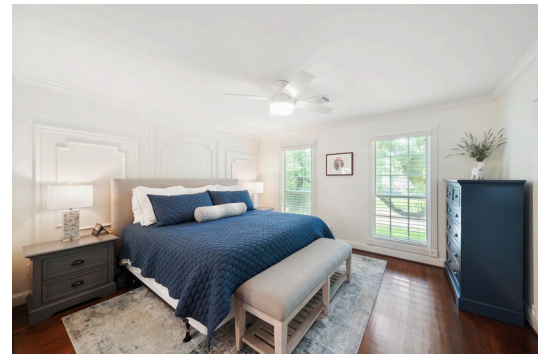
Tucked away behind frosted french doors is your primary suite, adorned with crown molding, custom woodwork, hardwood floors, and large walk-in closet with built-in shelving from the container store, again keeping organization top of mind.