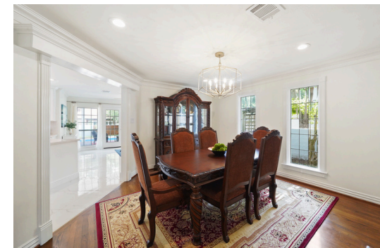
A view from the dining room open to your amazing kitchen and breakfast area, making hosting dinner for friends and family a breeze. Let's take a look!