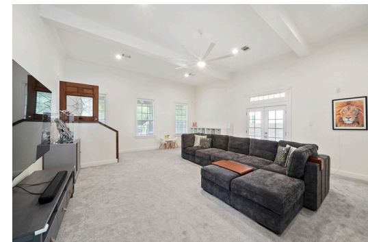
This space, currently used as a family room, could easily be converted to a 4th bedroom. With a large closet and french doors leading to the outside, it would be perfect for multigenerational living.