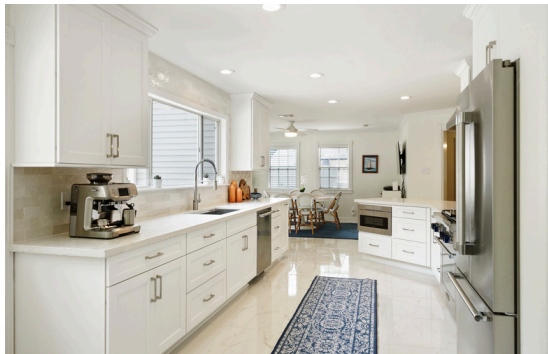
Loads of natural light fill this space. Clean and crisp with quartz countertops, loads of cabinet and counter space, and designer backsplash.