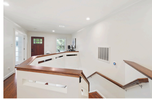
Through the wood door ahead is your second floor balcony.