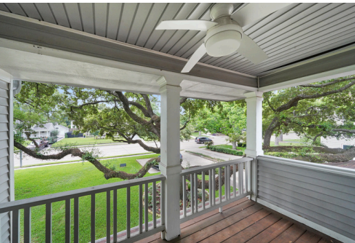
Picture sitting out here under the fan and enjoying your evening with a nice beverage!