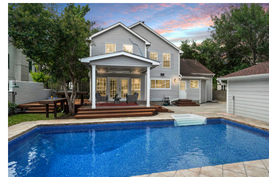
You have to see this home in person!