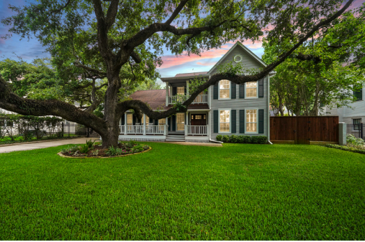
Welcome home to 834 W 43rd!