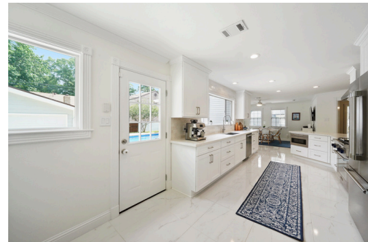
Quick access to your detached garage through this door.