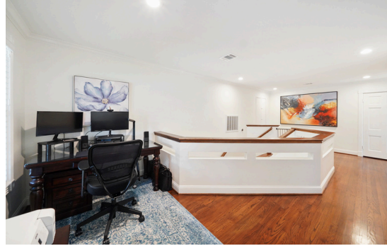
Right off the primary is the upstairs landing currently used as an office space but could be a perfect reading nook. Note the 2 doors ahead, the one to the left is decked attic space while the other is one of 2 closets on the second floor.