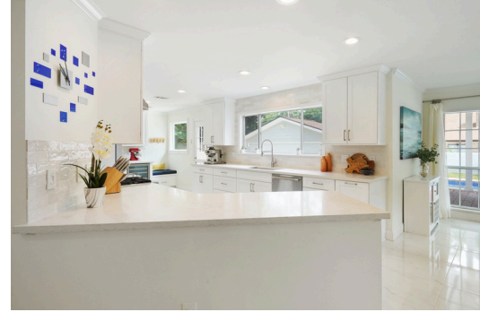
Be sure to check out our 3D tour.