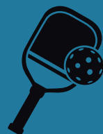
Pickle Ball Court