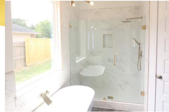
Bathroom Spa in primary bedroom