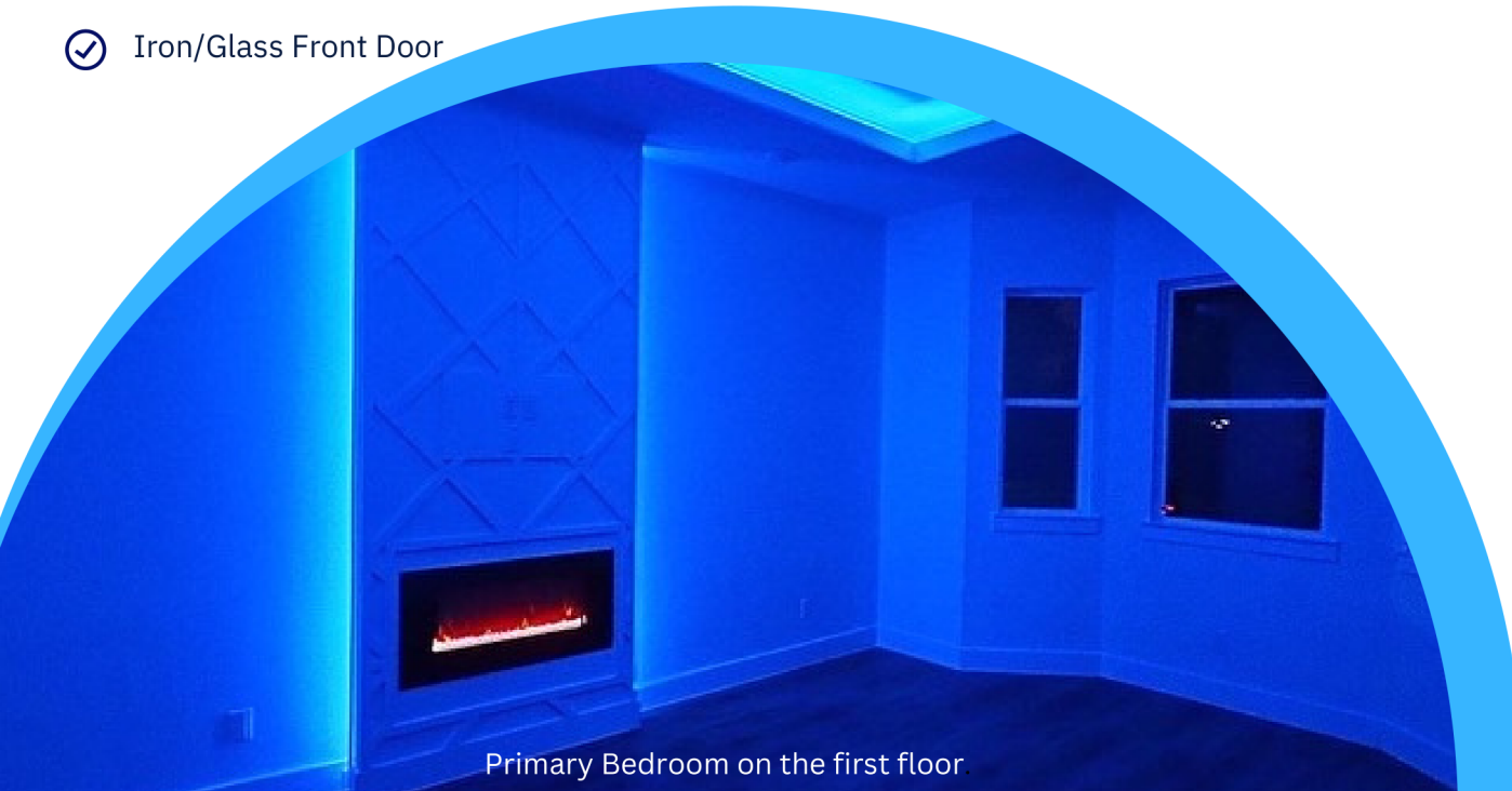
Primary Bedroom on the first floor

Call for sales price, floor plans, and promotions.