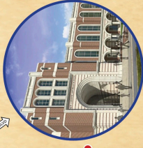
GRAND OAKS HIGH SCHOOL TO OPEN 2018