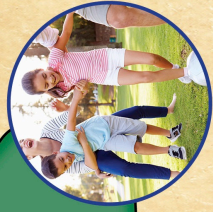
SENOVA RIDGE PARK

Amber Forest From the $370s David Weekley Homes Village Builders