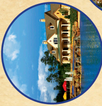
THE LAKE CLUB