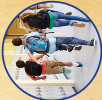
CLARK INTERMEDIATE SCHOOL TO OPEN 2018