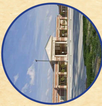
BIRCHAM WOODS ELEMENTARY