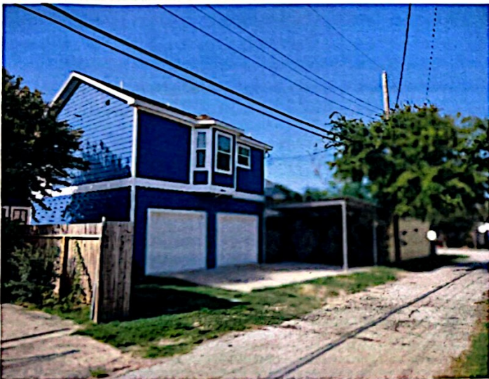
Garage Apt from alley view