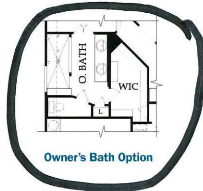
Owner's Bath Option