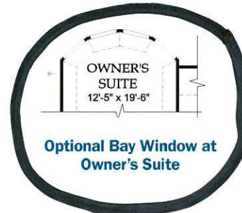
Optional Bay Window at Owner's Suite