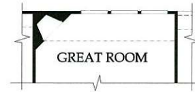
Optional Fireplace at Great Room