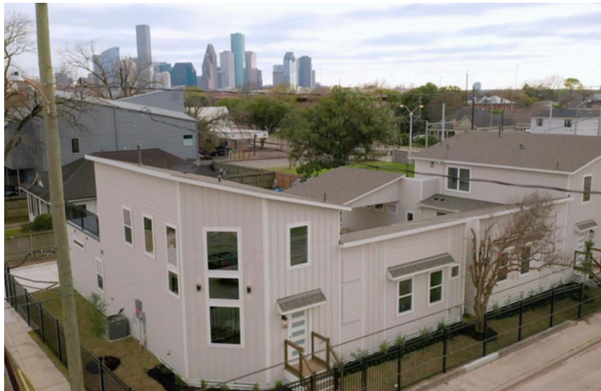
606 Boundary St. Houston, TX 77009