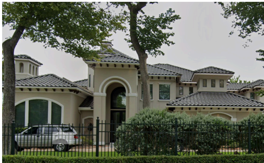
4 Waters Lake Blvd, Missouri City, TX 77459