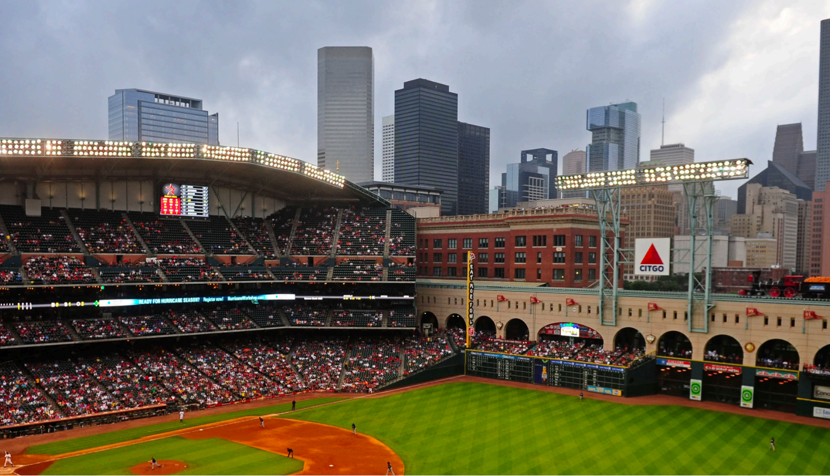
MINUTE MAID PARK 9 MINUTES 3.3 MILES