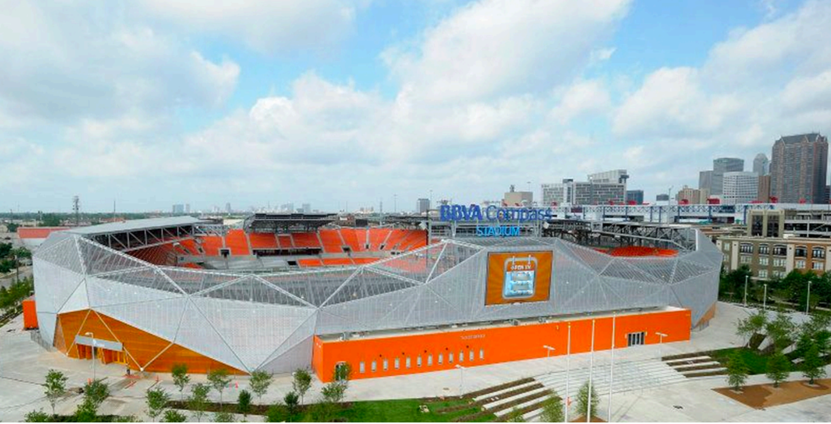
BBVA COMPASS 11 MINUTES 3.3 MILES