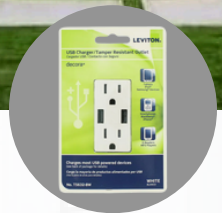
USB Charging Outlets