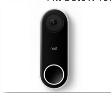
Nest Video Doorbell

All below features are included standard in all homes!