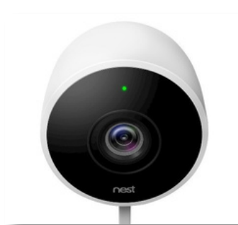
Nest Outdoor Camera