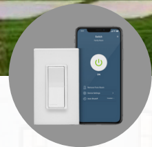
Wi-Fi Light Switches