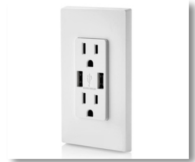
USB Charging Outlets

Effective on contracts signed beginning 2019. Not standard with investor programs. Builder reserves the right to make changes to the specifications, to change the features and or substitute items of similar quality without notice. All features subject to change without notice. Contact Builder for additional terms and exclusions. Any pictures shown are for illustration purposes only. Some pictures may not be owned by the Company and/or affiliates and are not intended to be representations of their work. The pictures are used only to illustrate an example or provide a graphic for design purposes only. © 2019 Houstonian Capital Investments. All Rights Reserved.