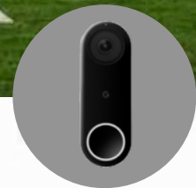
Nest Video Doorbell