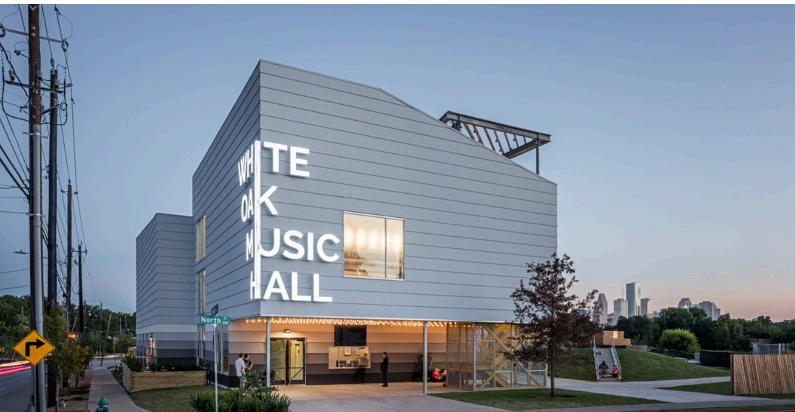
WHITE OAK MUSIC HALL 2 MINUTES 0.5 MILES