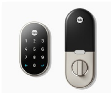
Nest x Yale Automated Lock