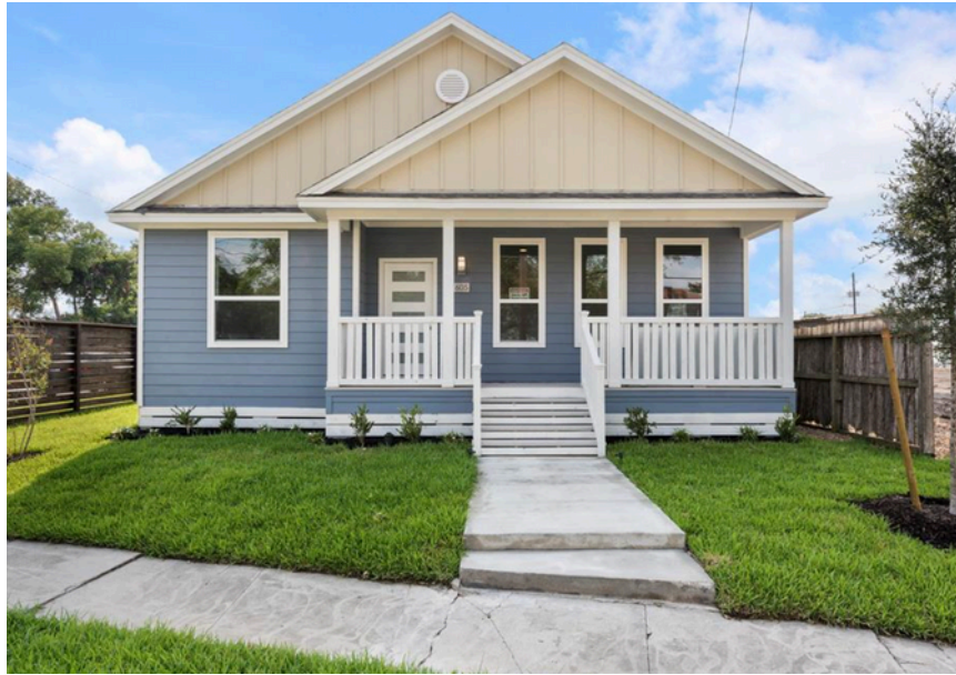
605 Dumble Street Houston, TX 77023