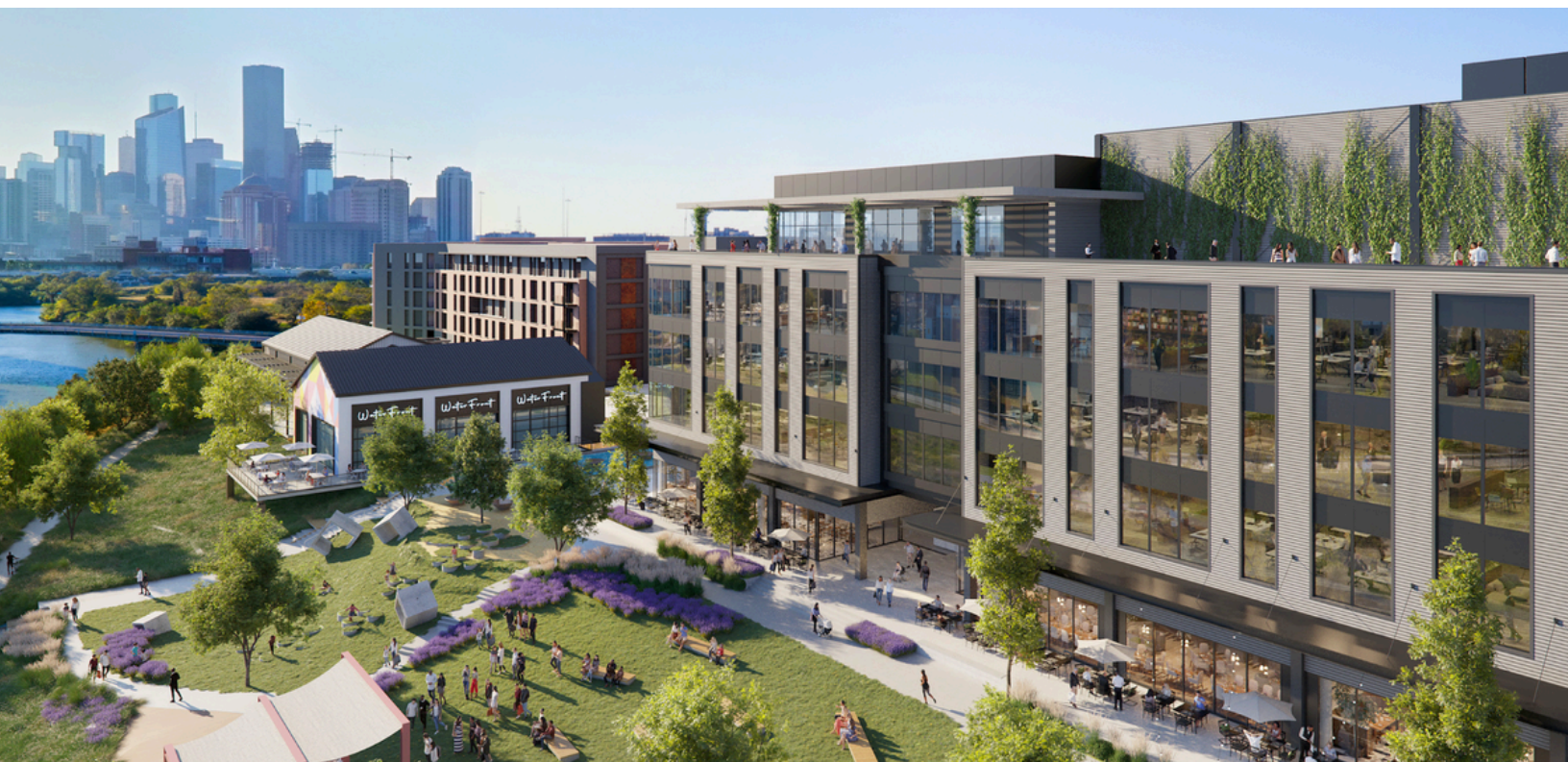
EAST RIVER PROJECT 10 MINUTES 3.0 MILES