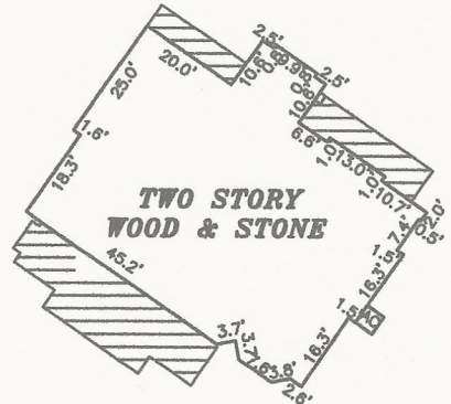
DETAIL: NOT TO SCALE