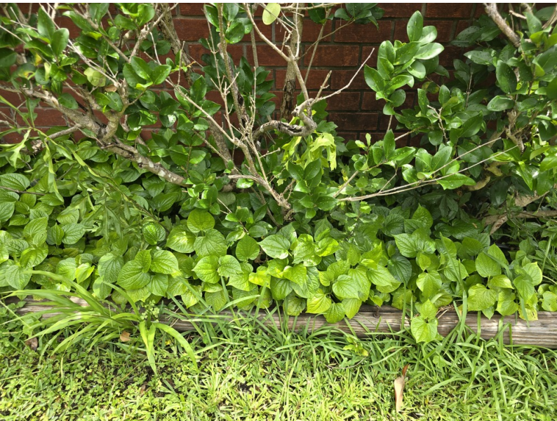
Conducive - Footing too low or soil line too high (L)