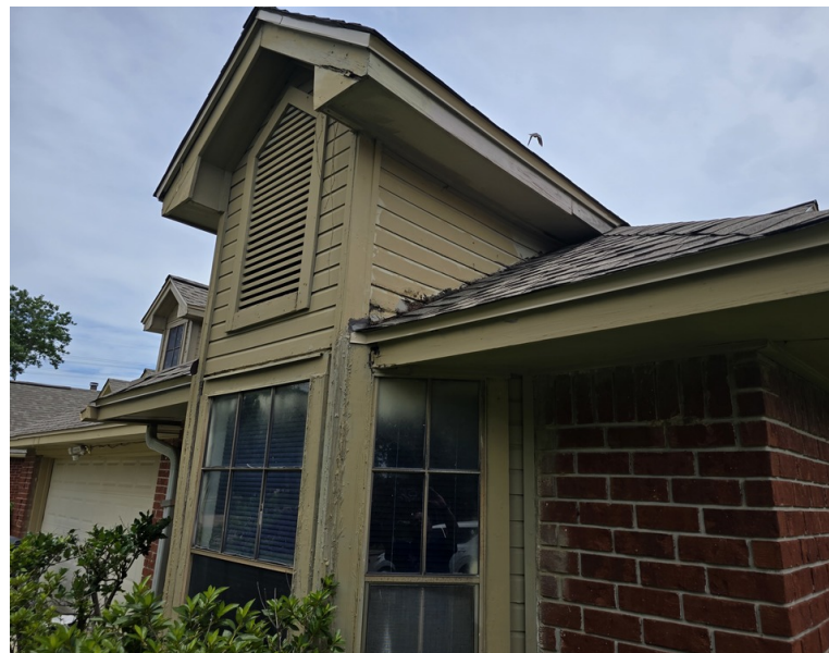
Conducive - Wood Rot (M)