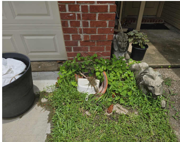
Conducive - Footing too low or soil line too high (L)