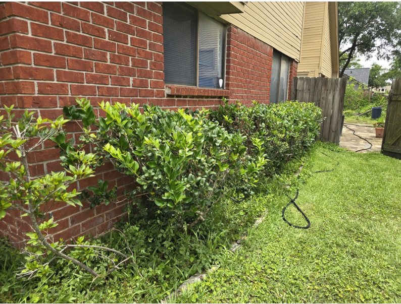
Conducive - Heavy Foliage (N)