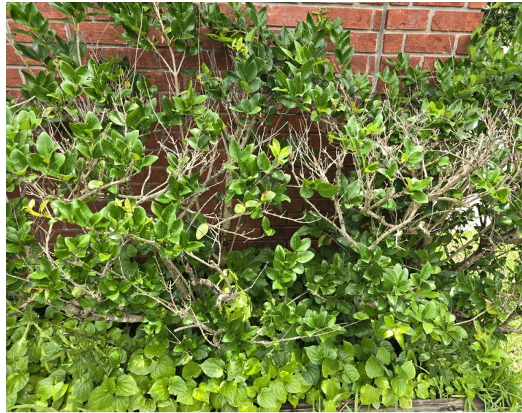
Conducive - Heavy Foliage (N)