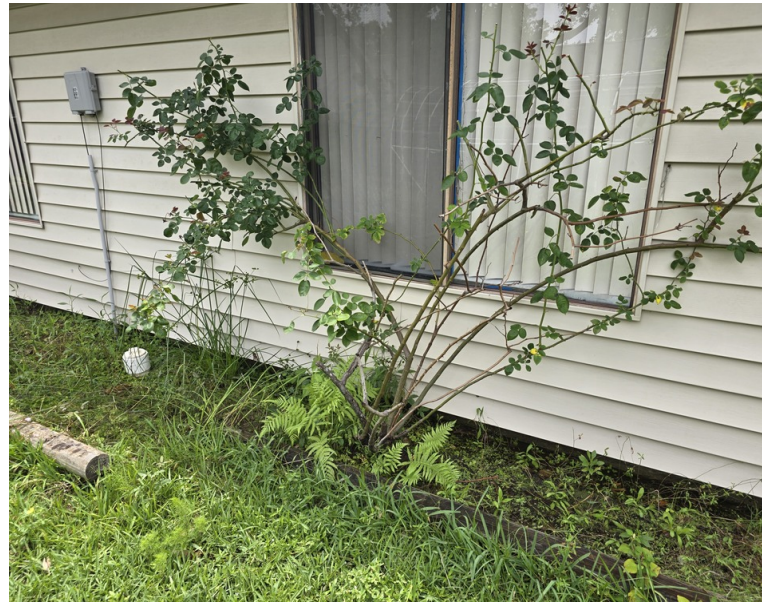
Conducive - Heavy Foliage (N)