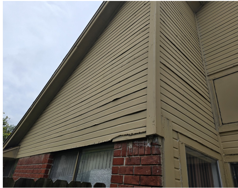
Conducive - Wood Rot (M)