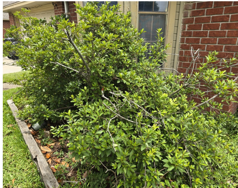
Conducive - Heavy Foliage (N)