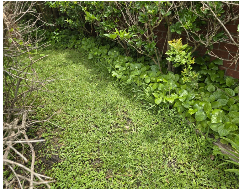
Conducive - Footing too low or soil line too high (L)