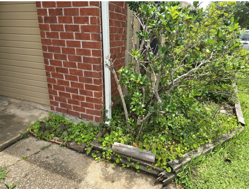
Conducive - Heavy Foliage (N)