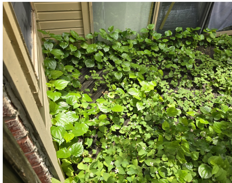
Conducive - Heavy Foliage (N)