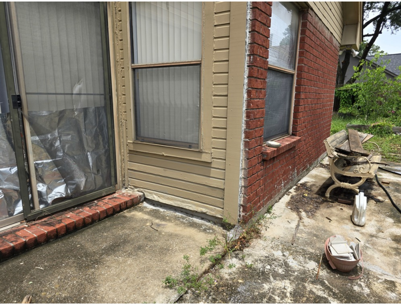
Conducive - Wood Rot (M)