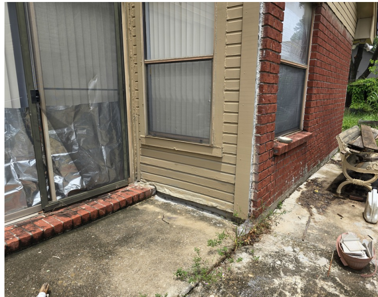
Conductive - Wood to Ground Contact (G)