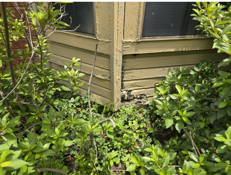
Conducive - Wood Rot (M)