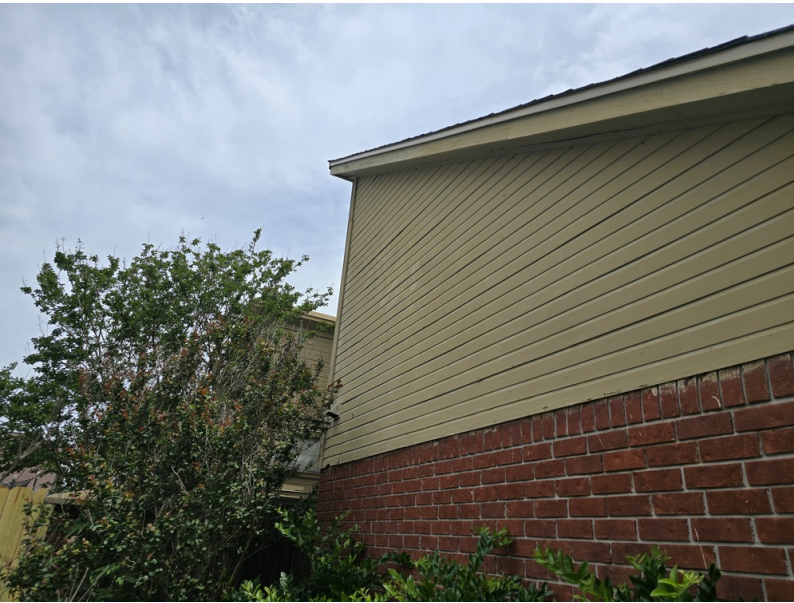
Conducive - Wood Rot (M)