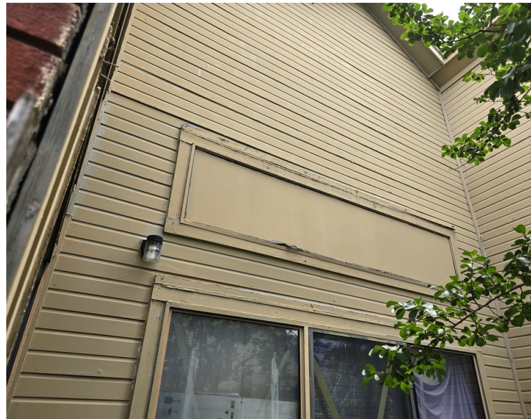
Conducive - Wood Rot (M)