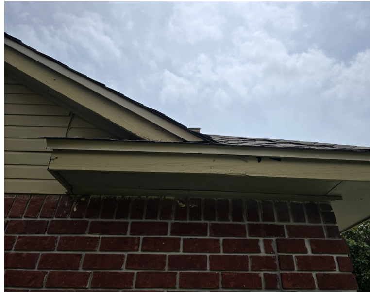
Conducive - Wood Rot (M)