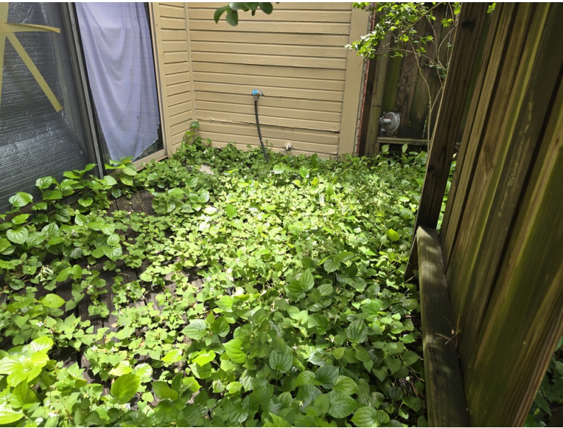
Conducive - Wood to Ground Contact (G)