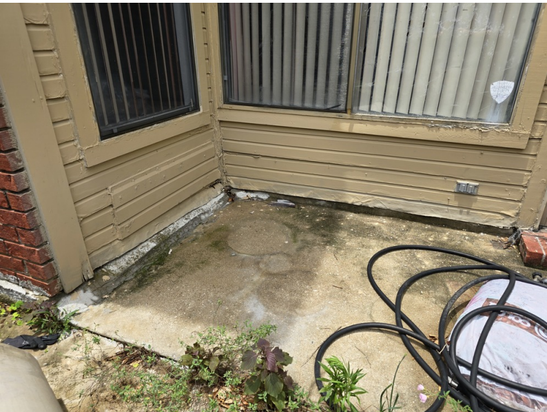
Conductive - Wood to Ground Contact (G)