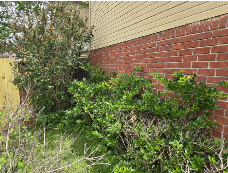
Conducive - Heavy Foliage (N)