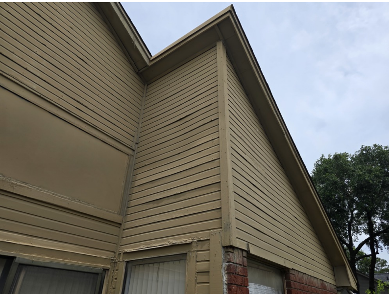
Conducive - Wood Rot (M)