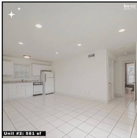
Unit #2: 581 sf