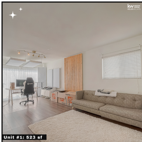
Unit #1: 523 sf