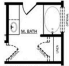
OPT. SOAKER TUB W/ SHOWER HEAD