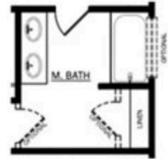
OPT. DOUBLE BOWL SINK