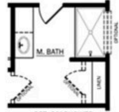
OPT. 60" SHOWER