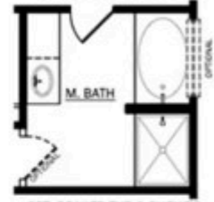
OPT. SOAKER TUB & SHOWER