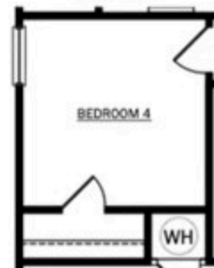
OPT. FLEX ROOM 2 - OPT. BEDROOM 4