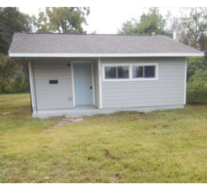
1205 REIN AVE, ORANGE, TX, 77630