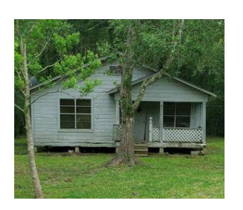
7128 PANTHER RUN, ORANGE, TX, 77632