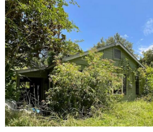
1900 LINK AVE, ORANGE, TX, 77630