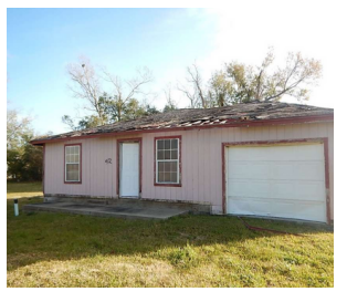
412 W PARK AVE, ORANGE, TX, 77630