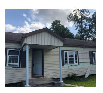
2006 2ND ST, ORANGE, TX, 77630