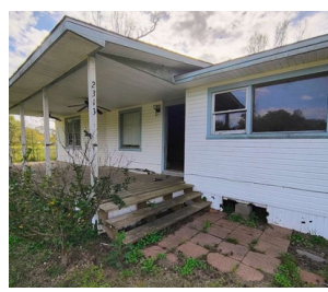
2313 HERRINGTON RD. ORANGE, TX, 77630