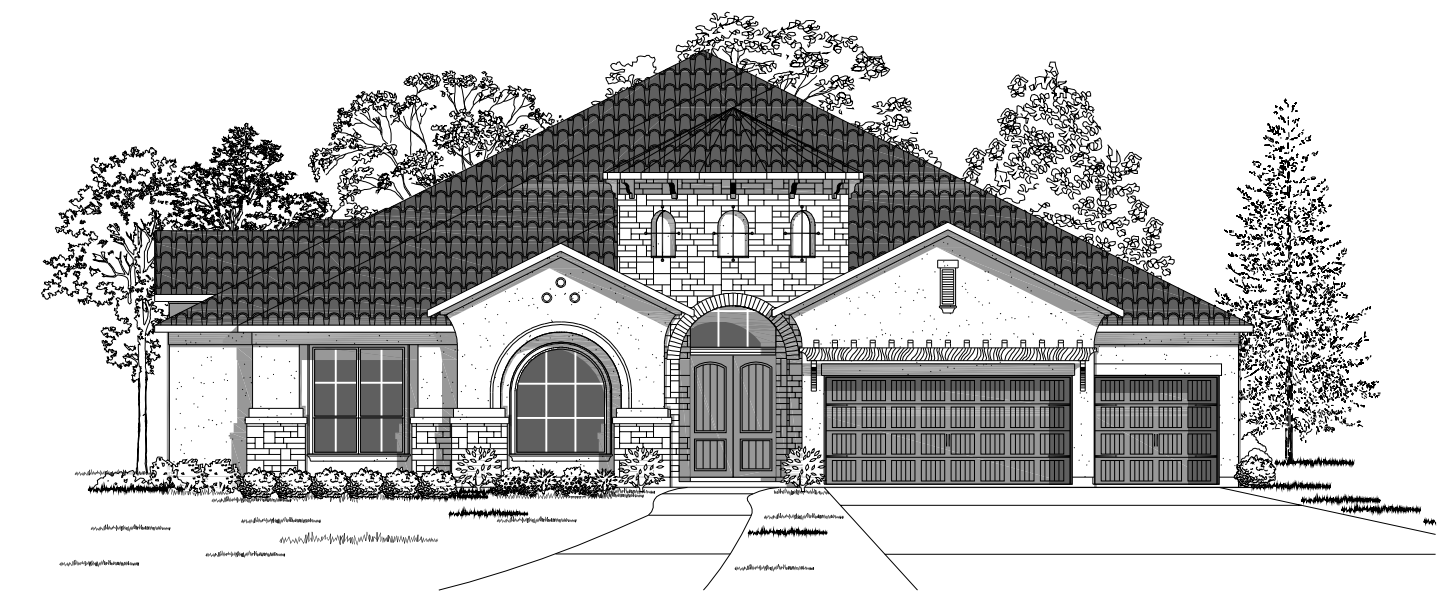
Design 4019S E-100

Note: This elevation is shown with an optional tile roof. Please see your Sales Professional for availability.