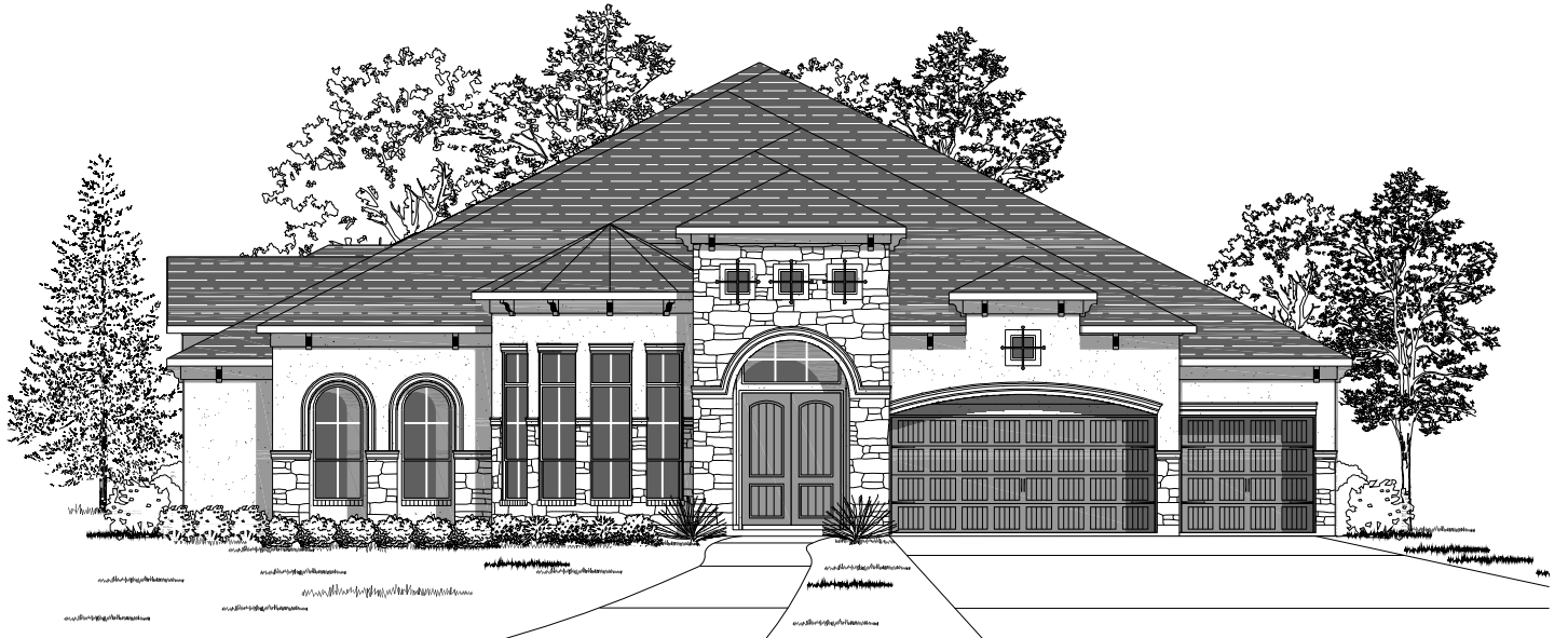
Design 4019S E-2