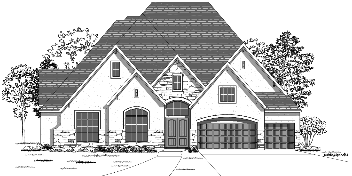
Design 4019S E-1