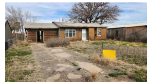
6315 E FM 40, LUBBOCK, TX, 79403