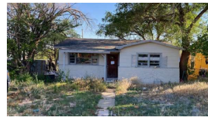
1503 E. 8TH ST., LUBBOCK, TX, 79403