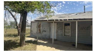
3406 E 15TH ST., LUBBOCK, TX, 79403