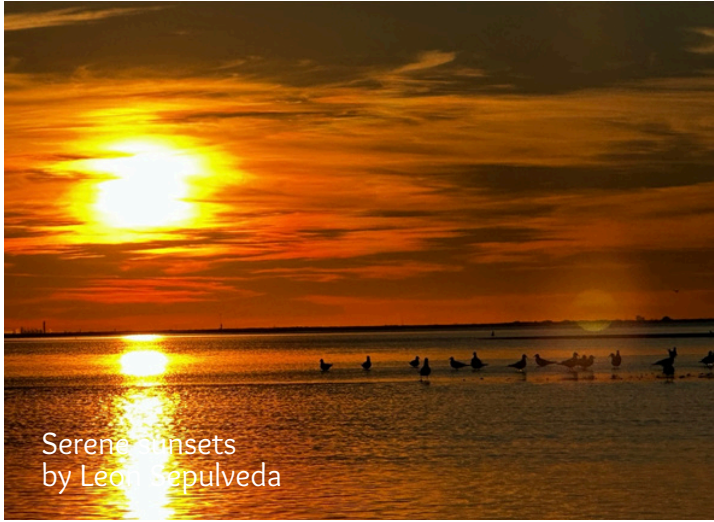
Serenity sunsets by Leon Sepulveda