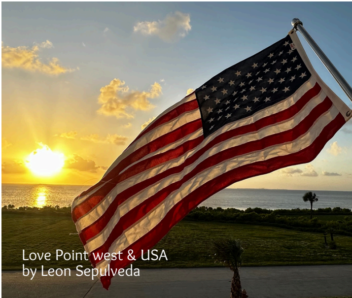
Love Point west & USA by Leon Sepulveda