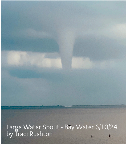
Large Water Spout - Bay Water 6/10/24 by Traci Rushton