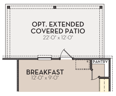
OPT. EXTENDED COVERED PATIO