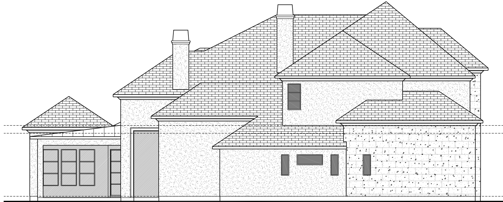
LEFT ELEVATION SCALE: 3/32" = 1'-0"