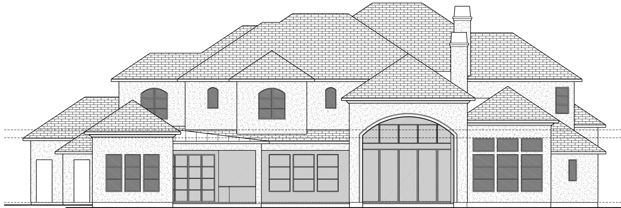
REAR ELEVATION SCALE: 3/32" = 1'-0"