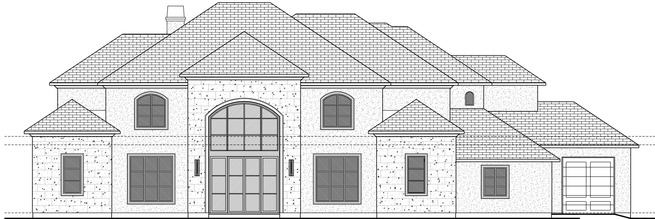
FRONT ELEVATION SCALE: 3/32" = 1'-0"