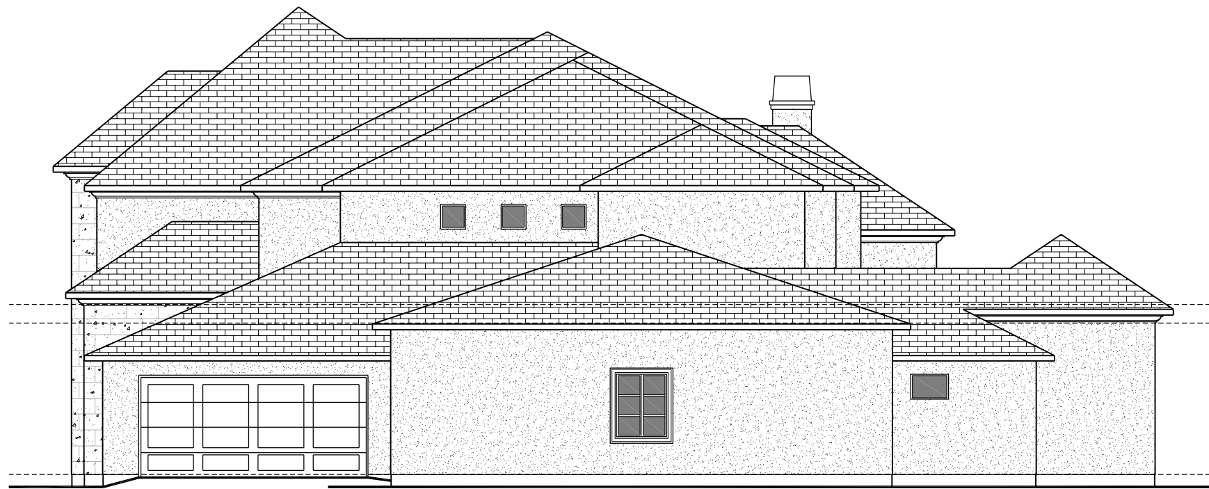
RIGHT ELEVATION SCALE: 3/32" = 1'-0"