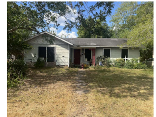
1780 EUCLID ST, BEAUMONT, TX, 77705