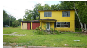
950 SHERMAN ST, BEAUMONT, TX, 77701