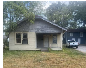
4105 CONGRESS ST, BEAUMONT, TX, 77705