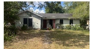
1780 EUCLID ST, BEAUMONT, TX, 77705