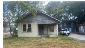
4105 CONGRESS ST, BEAUMONT, TX, 77705