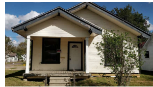
2694 CABLE AVE, BEAUMONT, TX, 77703