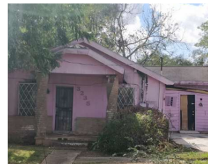
3235 WAVERLY ST, BEAUMONT, TX, 77705