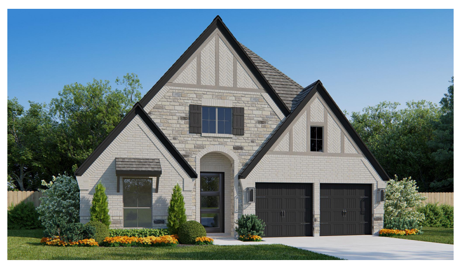
DESIGN 2504W E-90

This design, as originally designed and prior to any changes you make, is estimated to yield approximately the number of square feet shown on page 1. All dimensions are approximate. Square footage may vary based on as-built dimensions, configurations, plan opinions and/or the method of calculation. Designs and are conceptual illustrations that may differ from construction plans or completed improvements. A design may depict features not available on all homesites or in all communities. Perry Homes reserves the right to make changes in plans and specifications, and to substitute material of similar quality. Prices, terms, promotions, plans, dimensions, features, options, amenities, elevations, designs, square footages, specifications, materials, and availability of homes or communities are subject to change without notice or obligation. All obligations will be governed by a written contract. This design does not constitute a commitment to build a particular floor plan or home in any given community. Some floor plans, options, and/or elevations may not be available on certain homesites or in a particular community and may require additional charges. Please check with Perry Homes to verify current offerings in the communities you are considering. This rendering is the roperty of Perry Homes, LLC. Any reproduction or exhibition is strictly prohibited. © Perry Homes, LLC 2024