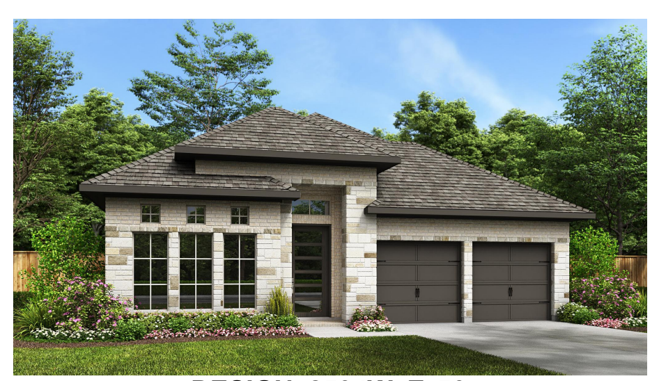
DESIGN 2504W E-56