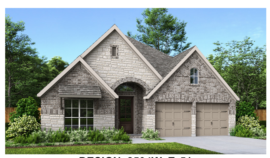
DESIGN 2504W E-51