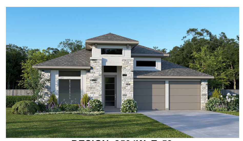
DESIGN 2504W E-59