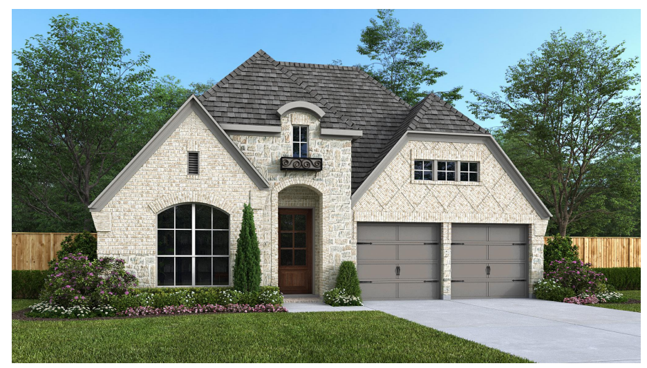
DESIGN 2504W E-52