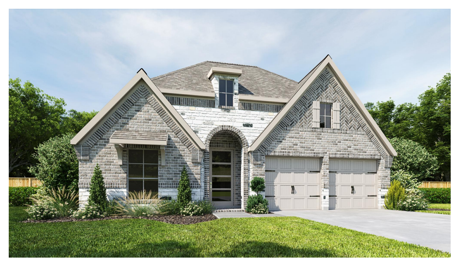
DESIGN 2504W E-30