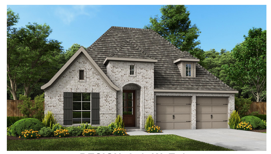
DESIGN 2504W E-1