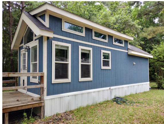
Blue Tiny House