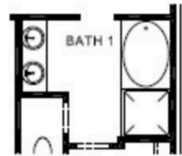
OPTIONAL BATH 1