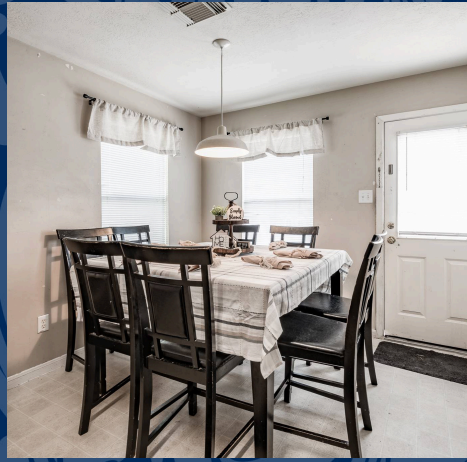
Large Windows throughout for Natural Lighting