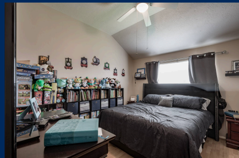
High Ceilings in Living Room and Master Bedroom