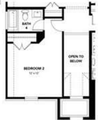
OPT. BATH 4