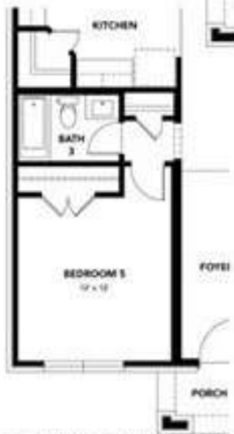
OPT. BEDROOM 5 WITH BATH 3