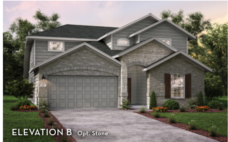
ELEVATION B Opt. Stone