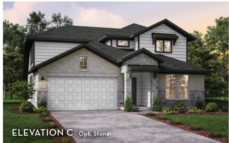
ELEVATION C Opt. Stone