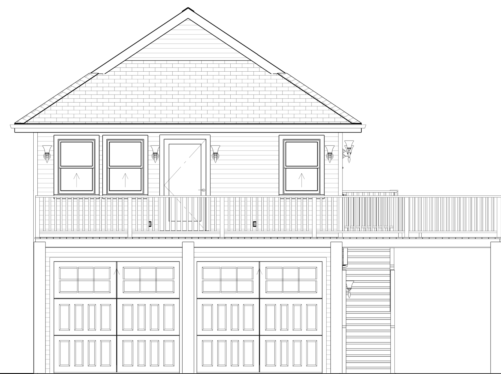
Exterior Elevation Front