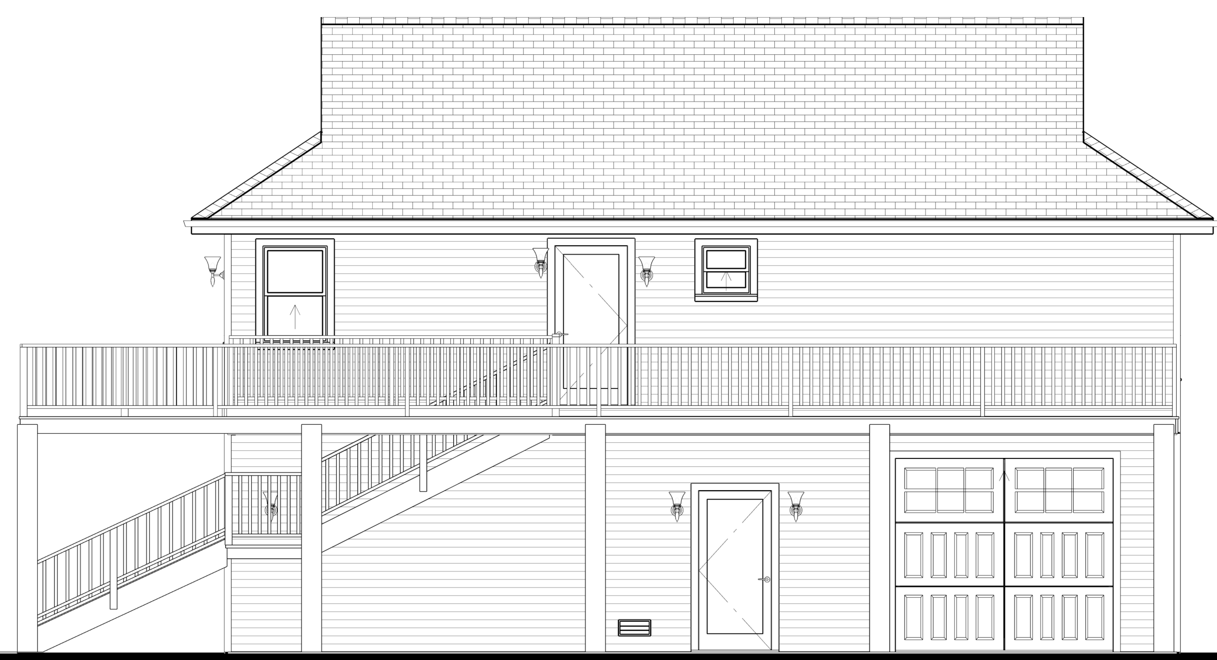
Exterior Elevation Right