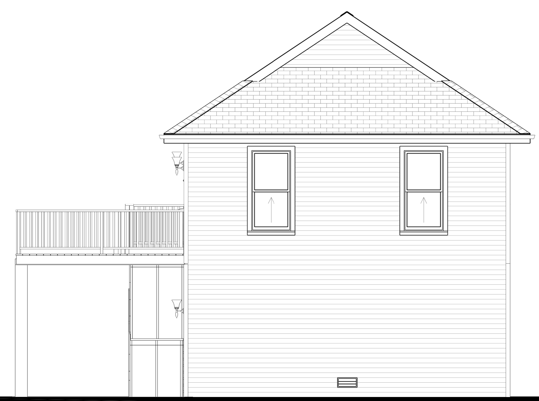
Exterior Elevation Back