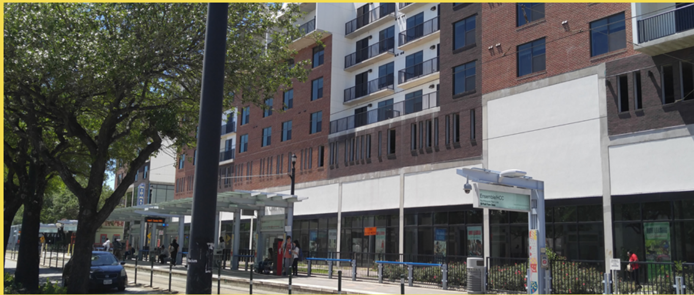
Mixed uses, high density, multi-modal transportation

Property owners and the community benefit from the designated walkable place. Local businesses get more exposure from increased foot-traffic. Homeowners and renters have a strengthened, well-being sense of community.