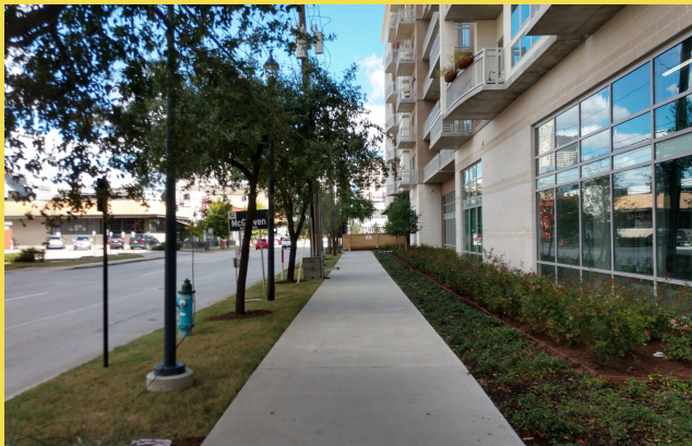
Wider sidewalks and more windows

Regulates the location of the parking area and the location and dimension of new curb cuts. The parking area must be located on the back or side of a proposed